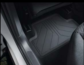
All-weather floor mats Rear, Titanium Black, 1 set = 2 pieces