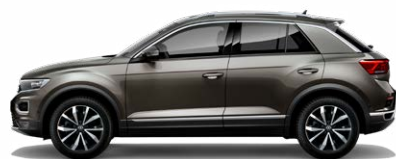
Indium Grey Metallic