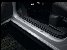
Door strip Front, aluminium, with lettering