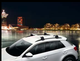
Supporting rods T-groove