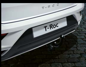
Towing hitch Fixed