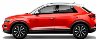
Flash Red with Pure White roof Non-Metallic