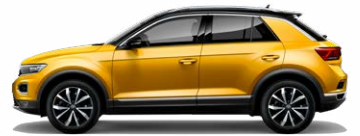
Curcuma Yellow with Black roof Metallic