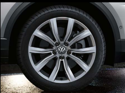
Grange Hill 18" alloy wheels (Optional on Design models)