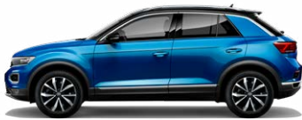
Ravenna Blue with Black roof Metallic