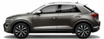
Indium Grey with Pure White roof Metallic