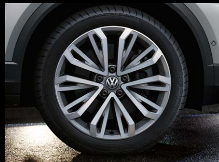
Montego Bay 18" alloy wheels (Optional on Design models)