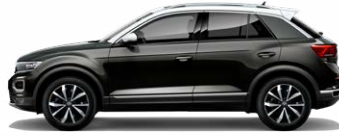
Urano Grey with Pure White roof Non-Metallic