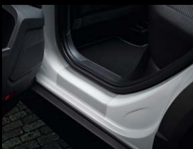
Protective film for the sill rail Rear, transparent