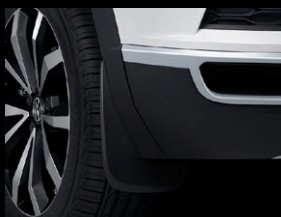
Mud flaps Rear