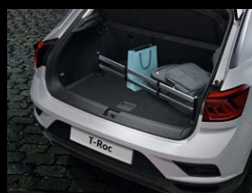
Cargo liner Luggage compartment plug-in module