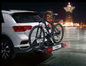
Bicycle carrier for towing hitch 2 bicycles, Premium, folding Load [kg]: 60 Own weight [kg]: 13,0