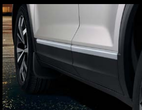
Mud flaps Front