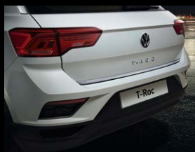
Protective strip for the tailgate Chrome look