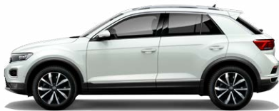
Pure White Non-Metallic