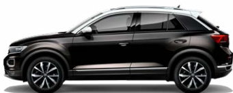
Deep Black with Pure White roof Pearl Effect