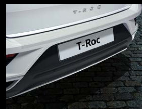
Loading sill protection Transparent