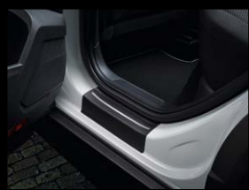
Protective film for the sill rail Rear, black / silver