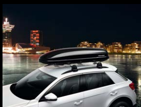
Roof box - 460 litres Comfort, high-gloss black