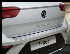
Loading sill protection Plastic, brushed stainless steel look