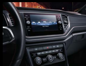
Activation document for AppConnect MirrorLink™, Apple CarPlay™, Android Auto™