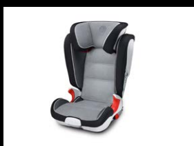
Child seat - 15 to 36 kg G2-3 Isofix backrest removable