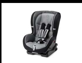
Child seat - 9 to 18 kg G1 Isofix DUO plus top tether