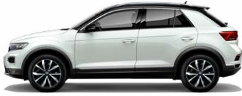
Pure White with Black roof Non-Metallic