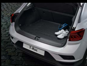
Boot inlay Variable loading surface, top position