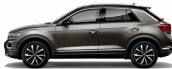
Indium Grey with Black roof Metallic