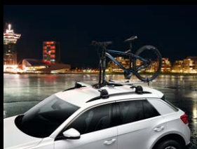
Bicycle holder 17kg, only in conjunction with: Roof bars and supporting rods with T groove profile