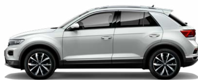
White Silver Metallic