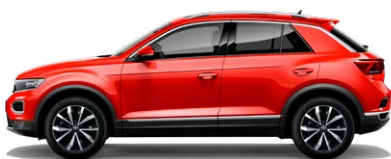
Flash Red Non-Metallic