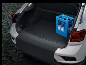
Boot mat Reversible velour/plastic nubs, vehicles with variable loading surface