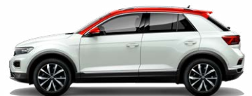
Pure White with Flash Red roof Non-Metallic