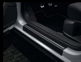
Protective film for the sill rail Front, black / silver