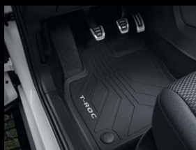
All-weather floor mats Front, Titanium Black, right-hand drive