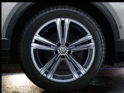
Sebring 18" alloy wheels (Optional on Design models)