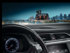
Inside rear-view mirror (Additional) Suction cap mounting