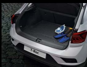
Boot tray Variable loading surface, top position