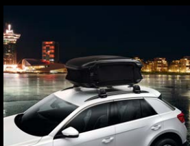
Roof box - 300-500 litres Urban loader, matt black