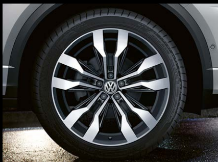
Suzuka 19" alloy wheels (Standard on R-Line model)