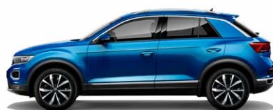
Ravenna Blue Metallic