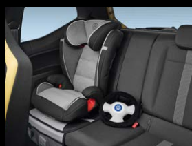
Child seat - 15 to 36 kg G2-3 pro