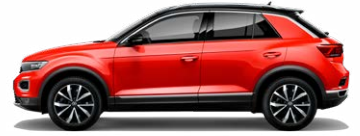
Flash Red with Black roof Non-Metallic