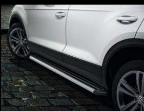
Footboard for the side skirt Transparent