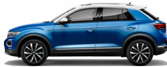
Ravenna Blue with Pure White roof Metallic