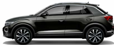
Urano Grey Non-Metallic