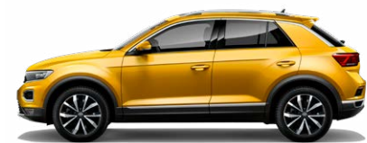
Curcuma Yellow (Only available on Design model) Metallic