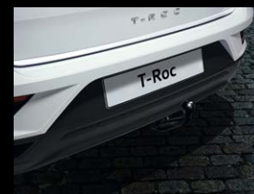
Towing hitch Detachable