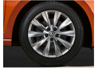
Las Minas 16" alloy wheels (Standard on Highline) (Included in beats Package)