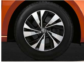
Seyne 15" alloy wheels (Optional on Trendline)