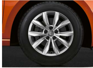
Salou 15" alloy wheels (Standard on Comfortline)