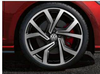
Brescia 18" alloy wheels (Optional on GTI)