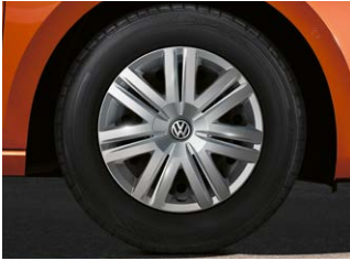
14" steel wheel cover (Standard on Trendline)