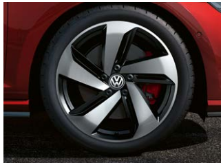
Milton Keynes 17" alloy wheels (Standard on GTI)