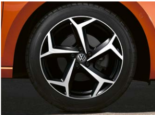
Bonneville 17" alloy wheels (Included in R-Line Package)