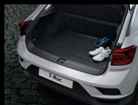
Boot inlay Variable loading surface, top position