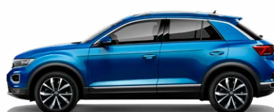
Ravenna Blue Metallic