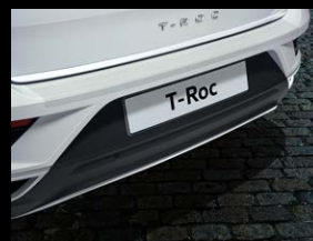
Loading sill protection Transparent