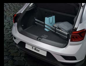
Cargo liner Luggage compartment plug-in module