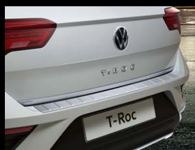
Loading sill protection Plastic, brushed stainless steel look