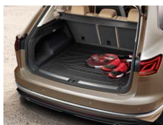
Boot mat - reversible Velour/plastic nubs