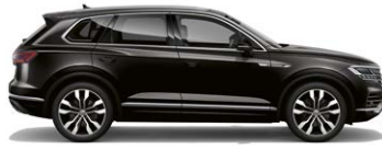
Deep Black Pearlescent