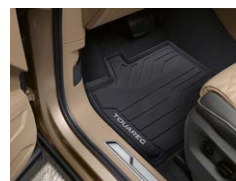
All-weather floormat set Front + rear