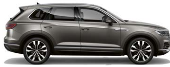
Silicon Grey Metallic