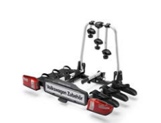
Bicycle carrier for the towing hitch 3 bicycles, folding, Compact III