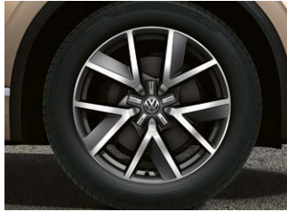
Braga 20" alloy wheels (Standard on Executive)