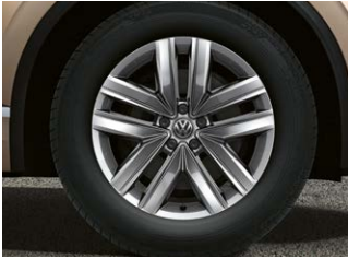
Esperance 19" alloy wheels (Standard on Luxury)