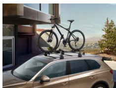
Bicycle holder* For bicycle frames of up to 100 mm (oval)/80 mm (round)