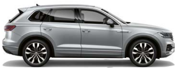
Antimonial Silver Metallic