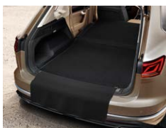
Cargo liner Luggage compartment plug-in module