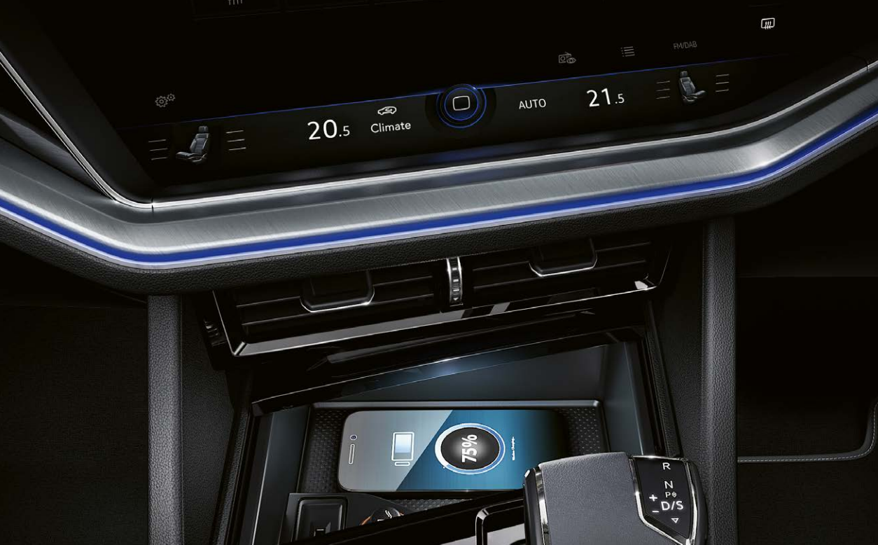
Ambient Lighting & Climate Control