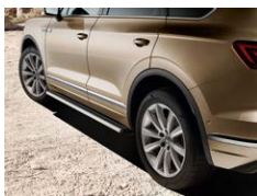
Footboard for the side skirt Aluminium, silver, anodised