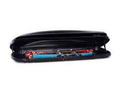
Roof box Comfort, 460 litres, high-gloss black