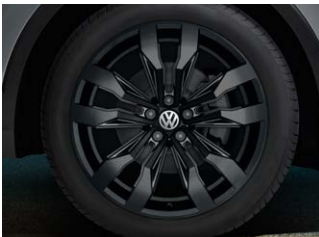
Black Suzuka 21" alloy wheels (Only with Black Style Package - Optional on Executive)