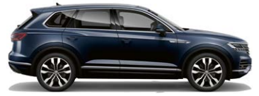
Moonlight Blue Pearlescent