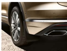
Mud flap Rear