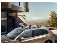
Supporting rods T-groove, Aero profile