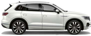
Oryx White Pearlescent