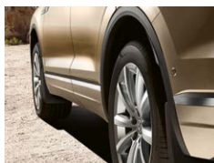
Mud flap Front