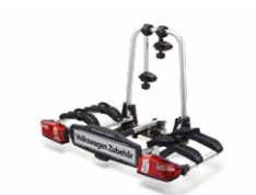
Bicycle carrier for the towing hitch 2 bicycles, folding, Compact III