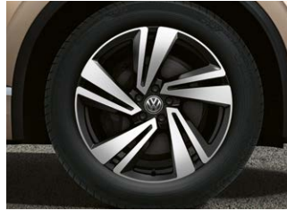
Nevada 20" alloy wheels (Optional on the Luxury model when the R-Line Package is selected)