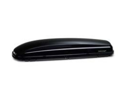
Roof box Comfort, 340 litres, high-gloss black