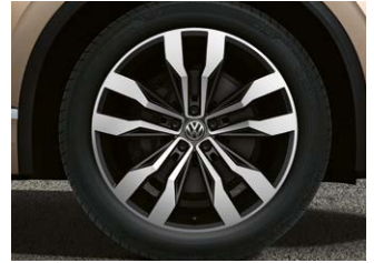
Suzuka 21" alloy wheels (Optional on Executive)