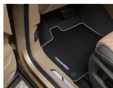
Textile footmats Premium