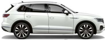
Pure White Solid

The illustrations on this page can only be regarded as a general guide as the printing process cannot render the true depth and brilliance of the paint finishes with absolute accuracy. Please note that certain paint and trim combinations may not be available.