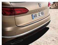
Loading lip protection Transparent