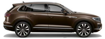
Tamarind Brown Metallic