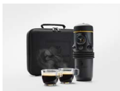
Espresso maker 12V on-board power operation