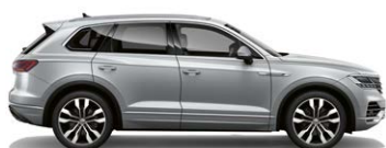
Antimonial Silver Metallic