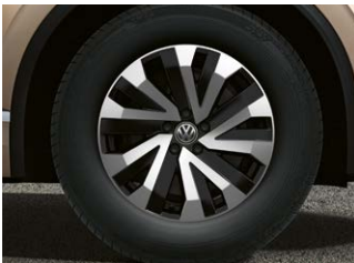
Concordia 18" alloy wheels (Optional on the Luxury)