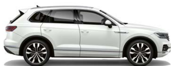
Pure White Solid

The illustrations on this page can only be regarded as a general guide as the printing process cannot render the true depth and brilliance of the paint finishes with absolute accuracy. Please note that certain paint and trim combinations may not be available.