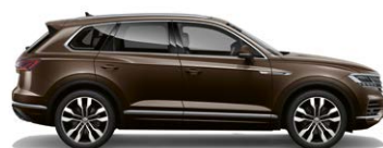
Tamarind Brown Metallic