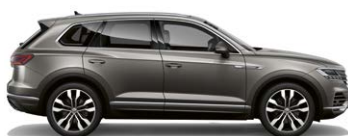
Silicon Grey Metallic