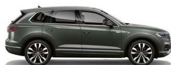
Juniper Green Metallic