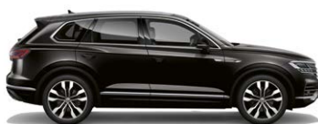
Deep Black Pearlescent