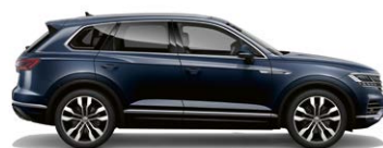
Moonlight Blue Pearlescent