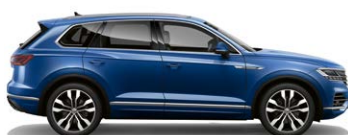
Aquamarine Blue* Metallic