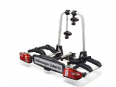
Bicycle carrier for the towing hitch 2 bicycles, folding, Compact III