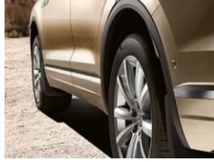
Mud flap Front