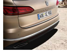
Loading lip protection Transparent