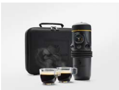
Espresso maker 12V on-board power operation