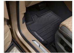
All-weather floor mat set Front + rear