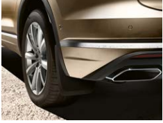
Mud flap Rear