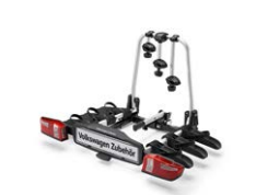
Bicycle carrier for the towing hitch 3 bicycles, folding, Compact III