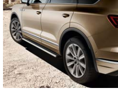
Footboard for the side skirt Aluminium, silver, anodised