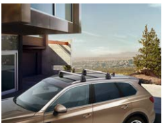
Supporting rods T-groove, Aero profile