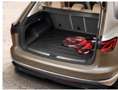
Boot mat - reversible Velour/plastic nubs