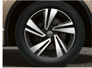
Nevada 20" alloy wheels (Optional on the Luxury model when the R-Line Package is selected)