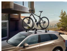
Bicycle holder* For bicycle frames of up to 100 mm (oval)/80 mm (round)