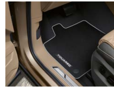
Textile footmats Premium