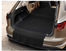
Cargo liner Luggage compartment plug-in module