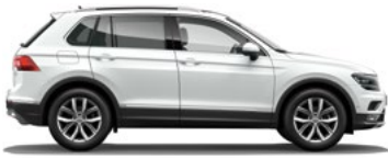
Pure White Solid

The illustrations on this page can only be regarded as a general guide as the printing process cannot render the true depth and brilliance of the paint finishes with absolute accuracy. Please note that certain paint and trim combinations may not be available.