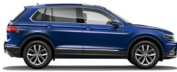
Atlantic Blue Metallic