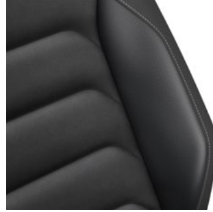
Art Velours Titanium Black