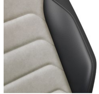
Art Velours Storm Grey