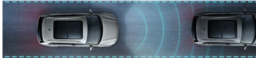
Adaptive Cruise Control with Front Assist (forward collision warning)