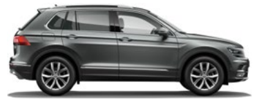
Indium Grey Metallic