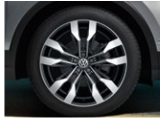
Suzuka 20" alloy wheels (Optional on Highline only with R-Line)