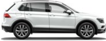
Pure White Solid