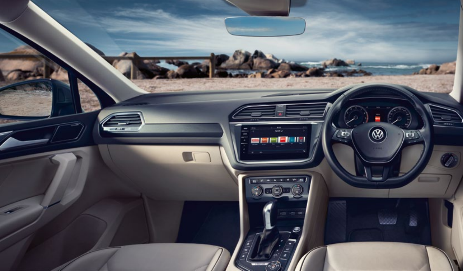
Highline interior (Optional Discover Pro show)