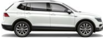
Pure White Solid