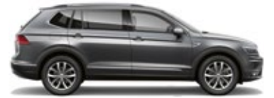
Platinum Grey Metallic