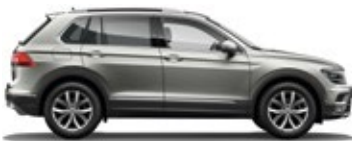
Tungsten Silver Metallic