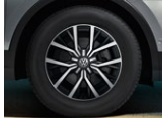
Tulsa 17" alloy wheels (Standard on Comfortline)