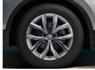
Kingston 18" alloy wheels (Standard on Highline and Optional on Comfortline)