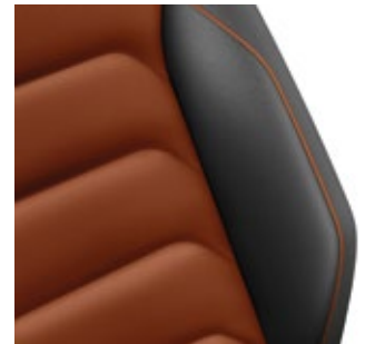
Vienna Safrano Orange / Titanium Black