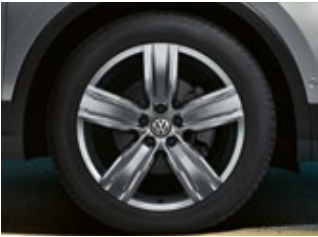
Victoria Falls 19" alloy wheels (Optional on all trim lines)