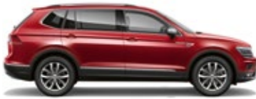
Ruby Red Metallic