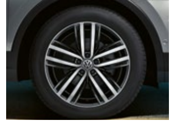
Auckland 19" alloy wheels (Optional on Trendline (Tiguan only), Comfortline and Highline)