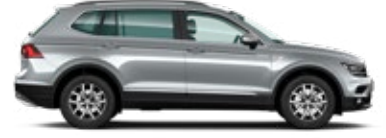
Pyrite Silver Metallic