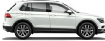
Oryx White Pearlescent