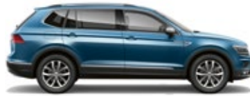
Blue Silk Metallic