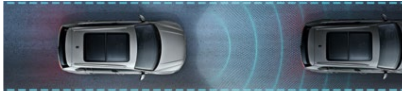
Adaptive Cruise Control with Front Assist (forward collision warning)