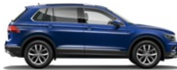
Atlantic Blue Metallic