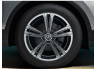
Sebring 19" alloy wheels (Optional on Comfortline only with R-Line)