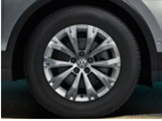
Montana 17" alloy wheels (Standard on Trendline)