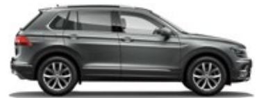
Indium Grey Metallic