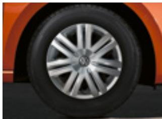
14" steel wheel cover (Standard on Trendline)