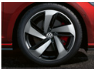
Milton Keynes 17" alloy wheels (Standard on GTI)