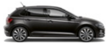
Limestone Grey Metallic