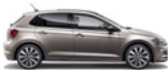
Reflex Silver Metallic