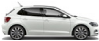
Pure White Non-Metallic

The illustrations on this page can only be regarded as a general guide as the printing process cannot render the true depth and brilliance of the paint finishes with absolute accuracy. Please note that certain paint and trim combinations may not be available.