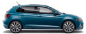
Reef Blue Metallic