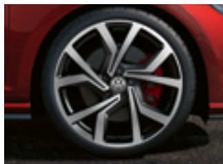
Brescia 18" alloy wheels (Optional on GTI)