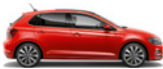
Flash Red Non-Metallic