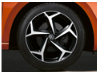
Bonneville 17" alloy wheels (Included in R-Line Package)