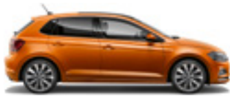
Energetic Orange Metallic