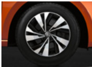
Seyne 15" alloy wheels (Optional on Trendline)