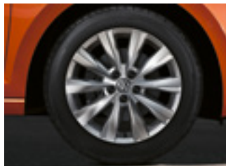
Las Minas 16" alloy wheels (Standard on Highline) (Included in beats Package)