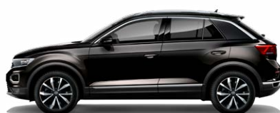
Deep Black Pearl Effect