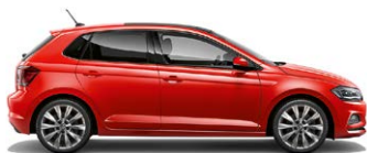
Flash Red Non-Metallic