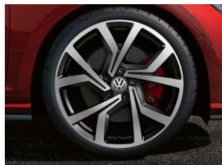
Brescia 18" alloy wheels (Optional on GTI)