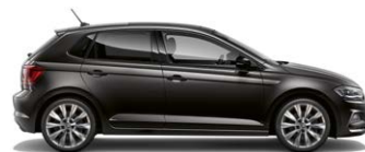
Limestone Grey Metallic