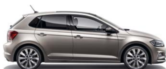
Reflex Silver Metallic