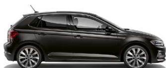
Deep Black Pearl Pearlescent