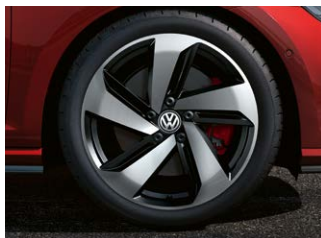
Milton Keynes 17" alloy wheels (Standard on GTI)