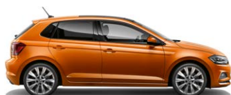
Energetic Orange Metallic