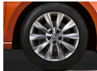
Las Minas 16" alloy wheels (Standard on Highline) (Included in beats Package)