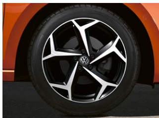
Bonneville 17" alloy wheels (Included in R-Line Package)