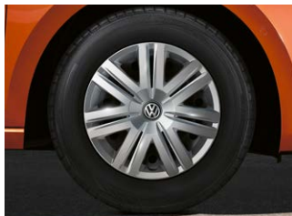
14" steel wheel cover (Standard on Trendline)