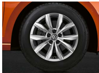
Salou 15" alloy wheels (Standard on Comfortline)