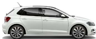
Pure White Non-Metallic

The illustrations on this page can only be regarded as a general guide as the printing process cannot render the true depth and brilliance of the paint finishes with absolute accuracy. Please note that certain paint and trim combinations may not be available.