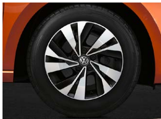
Seyne 15" alloy wheels (Optional on Trendline)