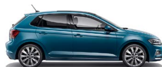
Reef Blue Metallic