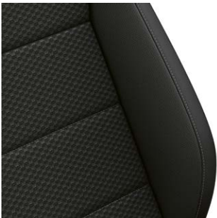
Lasano Titanium Black (Tiguan Allspace only)