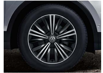
Nizza 18" alloy wheels (Standard on 2.0 TSI 132kW Comfortline 4M DSG)