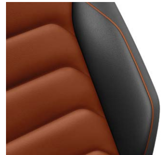
Vienna Safrano Orange / Titanium Black