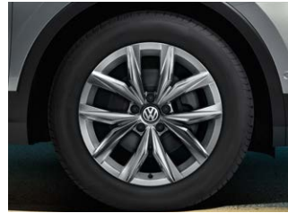
Kingston 18" alloy wheels (Standard on Highline and Optional on Comfortline)