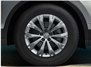
Montana 17" alloy wheels (Standard on Trendline)