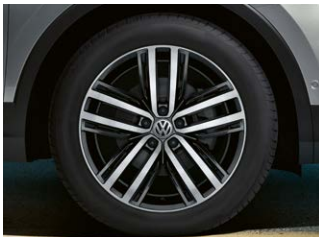
Auckland 19" alloy wheels (Optional on Trendline (Tiguan only), Comfortline and Highline)