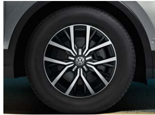
Tulsa 17" alloy wheels (Standard on Comfortline)