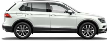
Oryx White Pearlescent