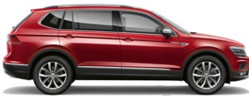
Ruby Red Metallic