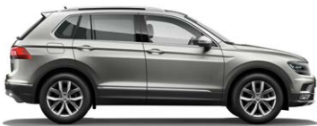
Tungsten Silver Metallic