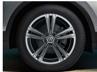
Sebring 19" alloy wheels (Optional on Comfortline only with R-Line)