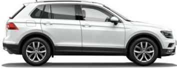
Pure White Solid