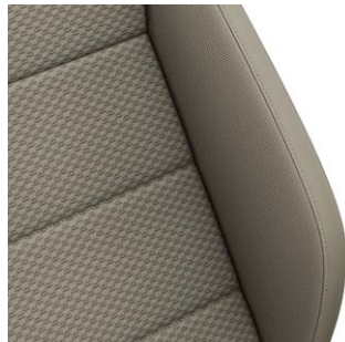
Lasano Storm Grey (Tiguan Allspace only)