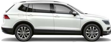
Pure White Solid