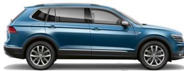
Blue Silk Metallic