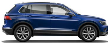
Atlantic Blue Metallic