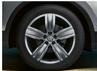
Victoria Falls 19" alloy wheels (Optional on all trim lines)