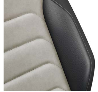
Art Velours Storm Grey