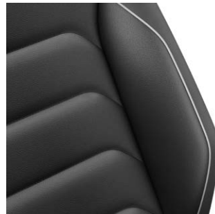
Vienna Titanium Black