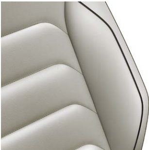
Vienna Storm Grey