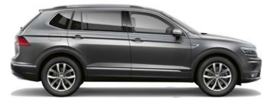
Platinum Grey Metallic