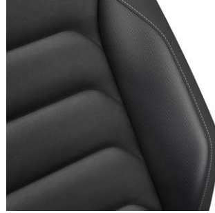
Art Velours Titanium Black