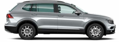
Pyrite Silver Metallic