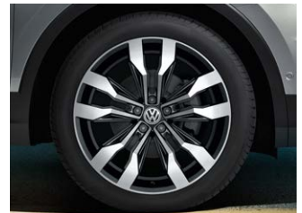
Suzuka 20" alloy wheels (Optional on Highline only with R-Line)