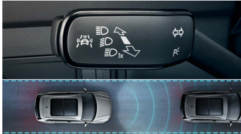
Adaptive Cruise Control with Front Assist (forward collision warning)

When ACC is activated, the vehicle automatically brakes and accelerates in a speed range set by the driver. If another vehicle approaches, the ACC brakes the car to the same speed and maintains the pre-selected distance.