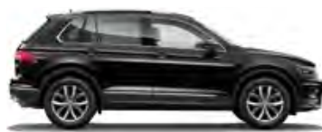
Deep Black Pearl Effect