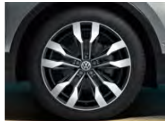
Suzuka 20" alloy wheels (Optional on Highline only with R-Line)