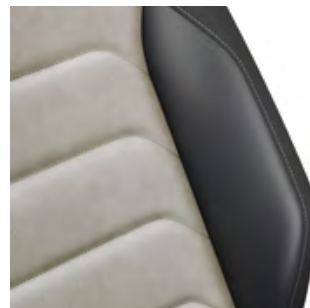
Art Velours Storm Grey