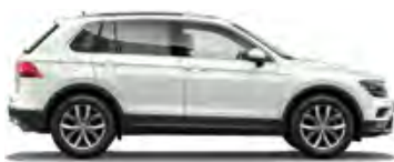
Oryx White Pearlescent