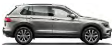
Tungsten Silver Metallic