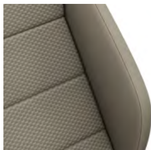
Lasano Storm Grey (Tiguan Allspace only)