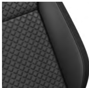
Rhombus Titanium Black / Storm Grey