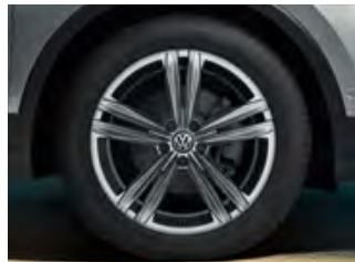
Sebring 19" alloy wheels (Optional on Comfortline only with R-Line)