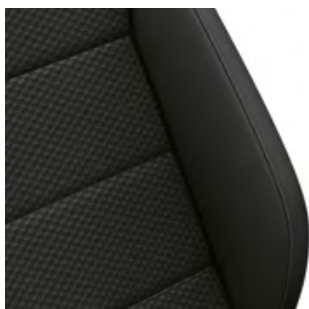
Lasano Titanium Black (Tiguan Allspace only)