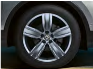
Victoria Falls 19" alloy wheels (Optional on all trim lines)