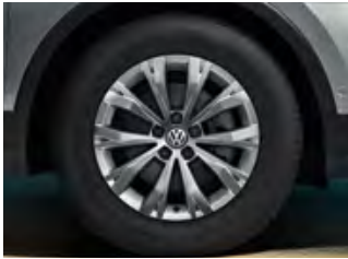
Montana 17" alloy wheels (Standard on Trendline)