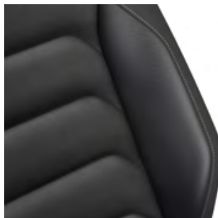
Art Velours Titanium Black