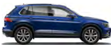
Atlantic Blue Metallic