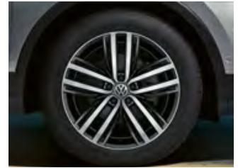
Auckland 19" alloy wheels (Optional on Trendline (Tiguan only), Comfortline and Highline)