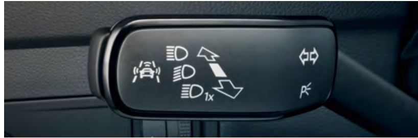
Adaptive Cruise Control with Front Assist (forward collision warning)

When ACC is activated, the vehicle automatically brakes and accelerates in a speed range set by the driver. If another vehicle approaches, the ACC brakes the car to the same speed and maintains the pre-selected distance.