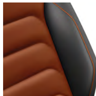
Vienna Safrano Orange / Titanium Black