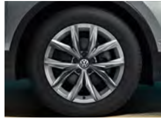
Kingston 18" alloy wheels (Standard on Highline and Optional on Comfortline)