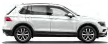
Pure White Solid

The illustrations on this page can only be regarded as a general guide as the printing process cannot render the true depth and brilliance of the paint finishes with absolute accuracy. Please note that certain paint and trim combinations may not be available.