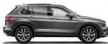
Indium Grey Metallic