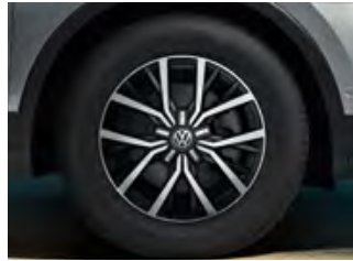
Tulsa 17" alloy wheels (Standard on Comfortline)