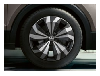
Manila 17" alloy wheels (Optional on Comfortline with R-Line)