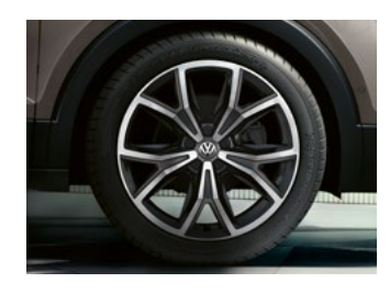
Cologne 18" alloy wheels (Standard on Highline)