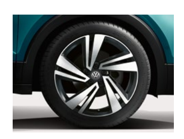
Nevada 18" alloy wheels (Optional on Highline with R-Line and Standard on 1.5 TSI R-Line)