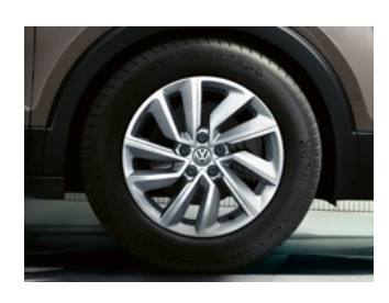
Belmont 16" alloy wheels (Standard on Comfortline)