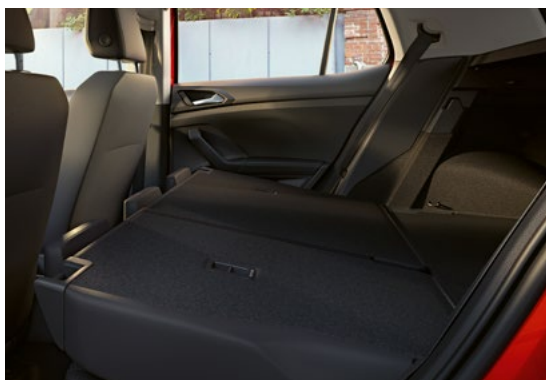
With the T-Cross' stylish and spacious interior, you'll always have enough room to do the things you've always wanted to. The T-Cross' adaptable rear seats are both foldable and slidable. Which means you can turn 377 litres of boot space into 455 litres of rear cabin space.