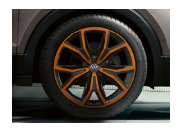
Cologne in Orange 18" alloy wheels (Optional on Highline Design Package in Energetic Orange)