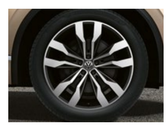
Suzuka 21" alloy wheels (Optional on Executive)