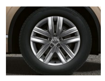
Esperance 19" alloy wheels (Standard on Luxury)