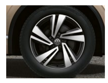
Nevada 20" alloy wheels (Optional on the Luxury model when the R-Line Package is seleceted)