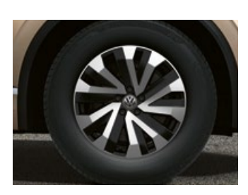
Concordia 18" alloy wheels (Optional on the Luxury)