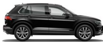
Deep Black Pearl Effect