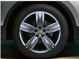
Victoria Falls 19" alloy wheels (Optional on all trim lines)