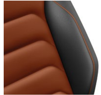
Vienna Safrano Orange / Titanium Black