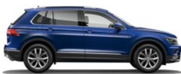
Atlantic Blue Metallic