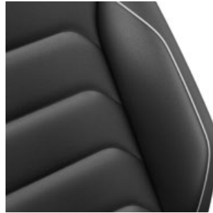
Vienna Titanium Black