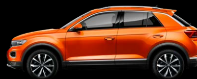
Energetic Orange Metallic