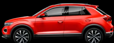
Flash Red Non-Metallic