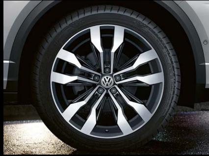
Suzuka 19" alloy wheels (Standard on R-Line model)