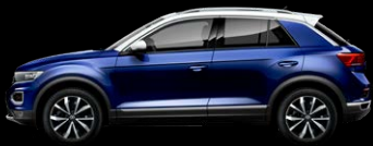
Atlantic Blue with Pure White roof Metallic