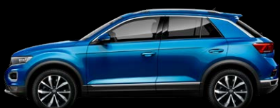
Ravenna Blue Metallic