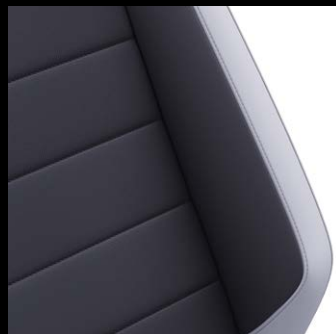
'Vienna' leather † Quartz/Ceramique HR (Standard on R-Line model and Optional on the Design models)