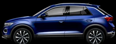
Atlantic Blue Metallic