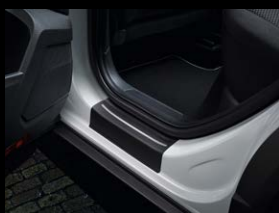
Protective film for the sill rail Rear, black / silver