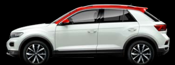
Pure White with Flash Red roof Non-Metallic