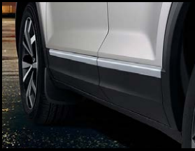
Mud flaps Front