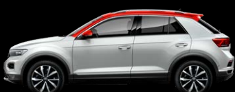
White Silver with Flash Red roof Metallic

International models shown, local specification may differ.