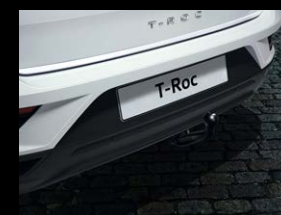
Towing hitch Detachable