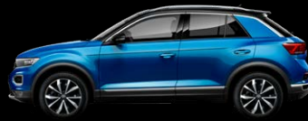
Ravenna Blue with Ninja Black roof Metallic