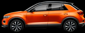
Energetic Orange with Ninja Black roof Metallic