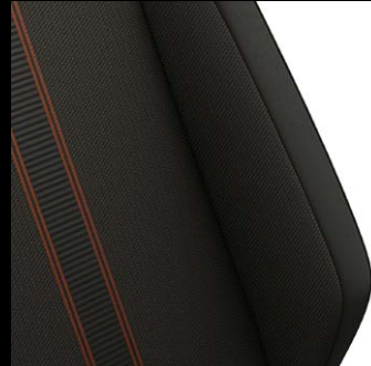
'Tracks 4' cloth Black/Energetic Orange GL (Optional on the Design models)