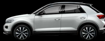
White Silver with Ninja Black roof Metallic