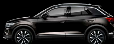
Deep Black Pearl Effect