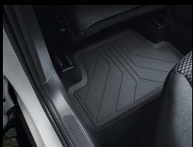
All-weather floor mats Rear, Titanium Black, 1 set = 2 pieces