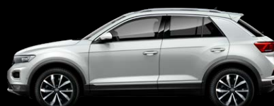
White Silver Metallic