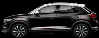
Deep Black with Pure White roof Pearl Effect