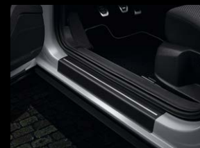
Protective film for the sill rail Front, black / silver