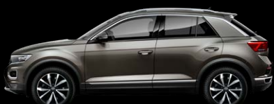
Indium Grey Metallic