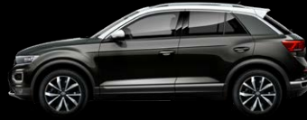
Urano Grey with Pure White roof Non-Metallic