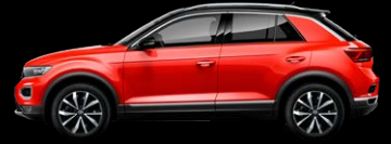
Flash Red with Ninja Black roof Non-Metallic