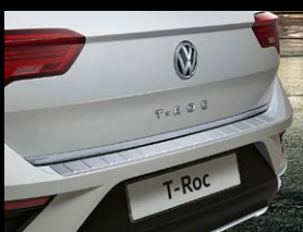
Loading sill protection Plastic, brushed stainless steel look