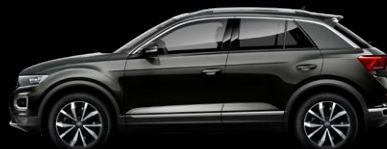
Urano Grey Non-Metallic