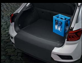
Boot mat Reversible velour/plastic nubs, vehicles with variable loading surface