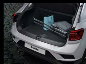
Cargo liner Luggage compartment plug-in module