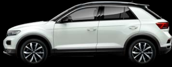
Pure White with Ninja Black roof Non-Metallic