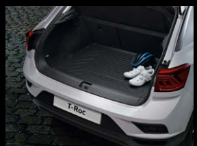
Boot inlay Variable loading surface, top position