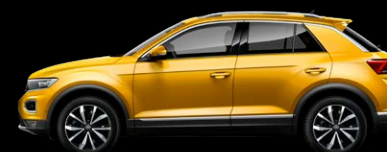
Curcuma Yellow Metallic