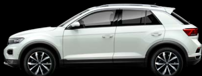
Pure White Non-Metallic