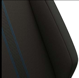
'Tracks 4' cloth Black/Ravenna Blue GK (Optional on the Design models)