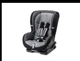
Child seat - 9 to 18 kg G1 Isofix DUO plus top tether