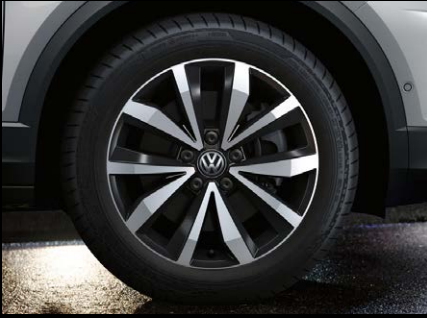
Mayfield 17" alloy wheels (Standard on Design models)

Choose from a variety of options that will ensure your T-Roc is as stylish as it is pleasurable to drive.