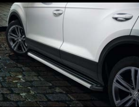
Footboard for the side skirt Transparent