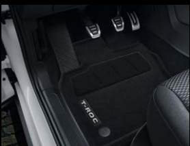
Textile footmat Front and rear, with T-Roc lettering, 1 set = 4 pieces