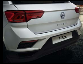
Protective strip for the tailgate Chrome look