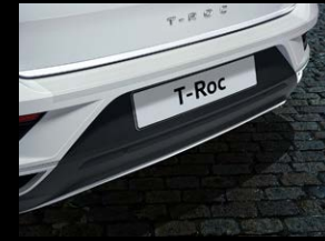
Loading sill protection Transparent