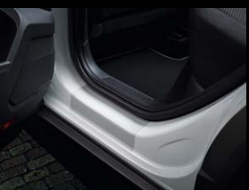
Protective film for the sill rail Rear, transparent