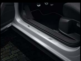
Door strip Front, aluminium, with lettering