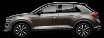
Indium Grey with Ninja Black roof Metallic