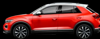
Flash Red with White roof Non-Metallic