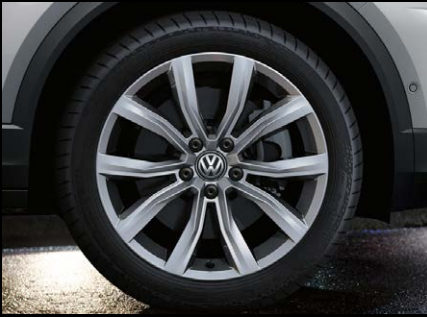
Grange Hill 18" alloy wheels (Optional on Design models)