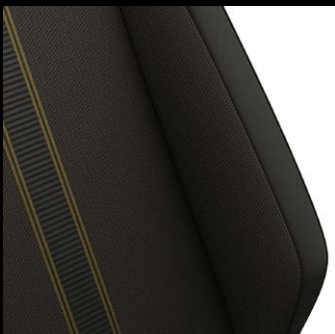
Track 4' Black/Curcuma Yellow GJ (Optional on the Design models)