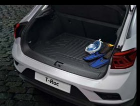
Boot tray Variable loading surface, top position