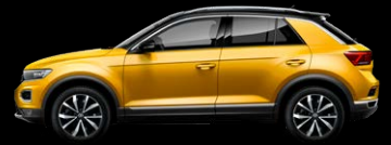
Curcuma Yellow with Ninja Black roof Metallic