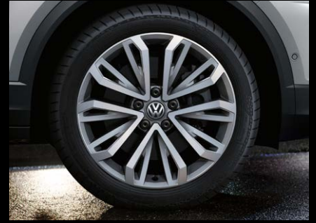
Montego Bay 18" alloy wheels (Optional on Design models)