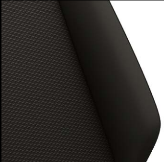
Titanium Black EL* (Optional on the Design models)