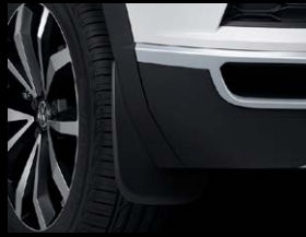
Mud flaps Rear