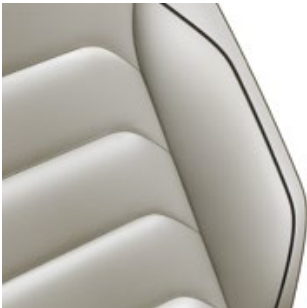
Vienna Storm Grey