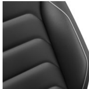
Vienna Titanium Black