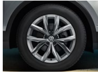
Kingston 18" alloy wheels (Standard on Highline and Optional on Comfortline)