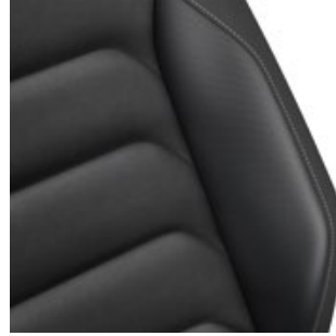
Art Velours Titanium Black