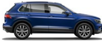
Atlantic Blue Metallic