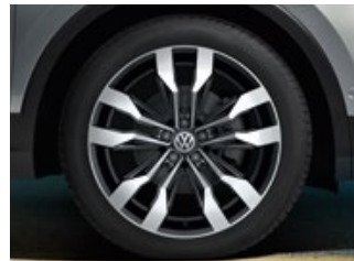
Suzuka 20" alloy wheels (Optional on Highline only with R-Line)