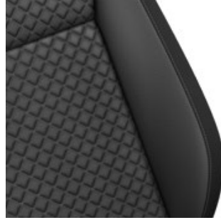
Rhombus Titanium Black / Storm Grey