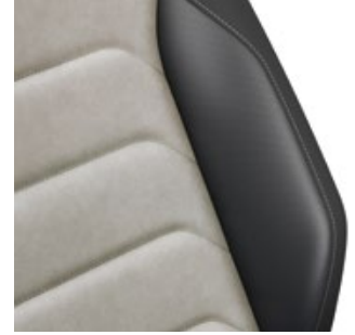
Art Velours Storm Grey