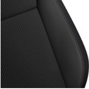
Microdot Titanium Black (Tiguan only)