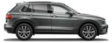
Indium Grey Metallic