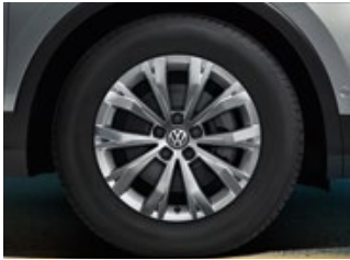
Montana 17" alloy wheels (Standard on Trendline)