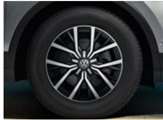
Tulsa 17" alloy wheels (Standard on Comfortline)