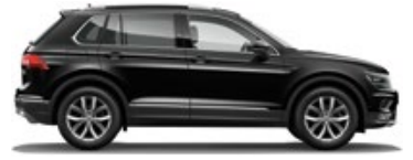
Deep Black Pearl Effect