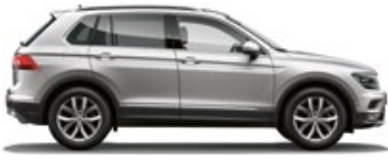
Reflex Silver Metallic