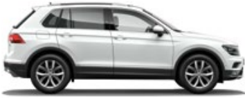
Pure White Solid

The illustrations on this page can only be regarded as a general guide as the printing process cannot render the true depth and brilliance of the paint finishes with absolute accuracy. Please note that certain paint and trim combinations may not be available.