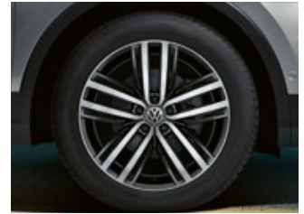
Auckland 19" alloy wheels (Optional on Trendline (Tiguan only), Comfortline and Highline)