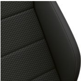
Lasano Titanium Black (Tiguan Allspace only)