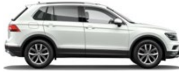
Oryx White Pearlescent