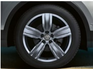
Victoria Falls 19" alloy wheels (Optional on all trim lines)