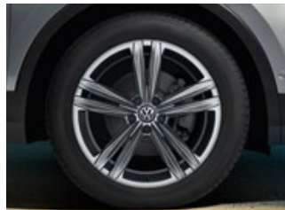
Sebring 19" alloy wheels (Optional on Comfortline only with R-Line)