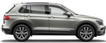
Tungsten Silver Metallic