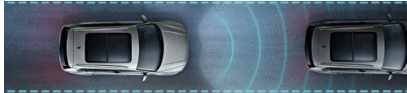
Adaptive Cruise Control with Front Assist (forward collision warning)