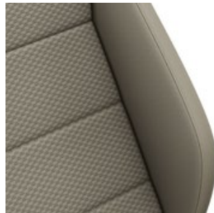
Lasano Storm Grey (Tiguan Allspace only)