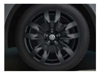
Black Suzuka 21" alloy wheels (Only with Black Style Package -Optional on Executive)