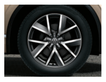
Braga 20" alloy wheels (Standard on Executive)