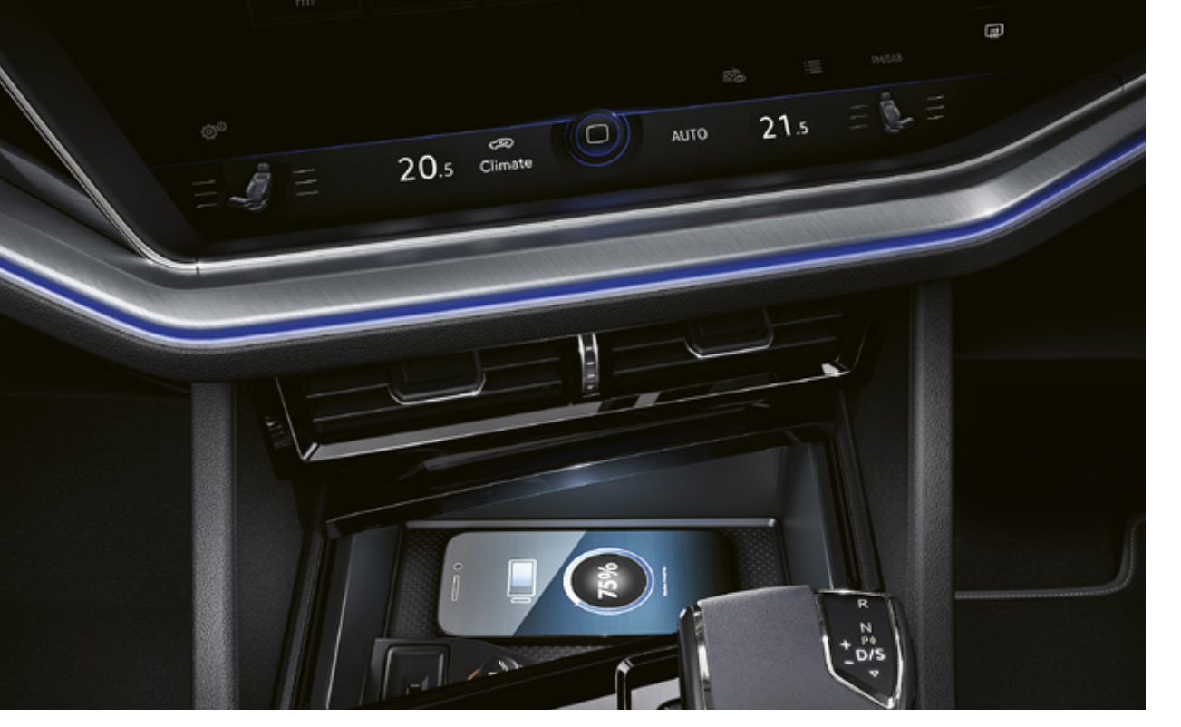
Ambient Lighting & Climate Control