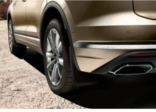
There's no mistaking the Touareg, with its distinctive contours and assertive lines working in tandem to direct you towards its extended bonnet. Its tail light clusters create an attractive rear design of chrome trapezoid tailpipes on either side, while the roof rails offer more versatility when required.