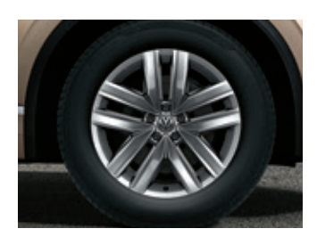
Esperance 19" alloy wheels (Standard on Luxury)