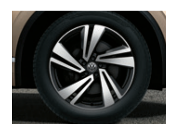
Nevada 20" alloy wheels (Optional on the Luxury model when the R-Line Package is seleceted)