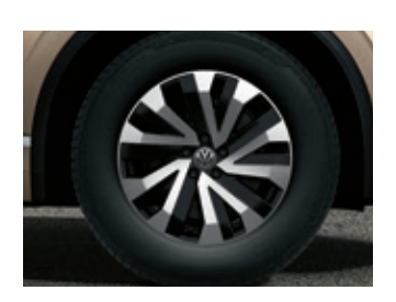
Concordia 18" alloy wheels (Optional on the Luxury)