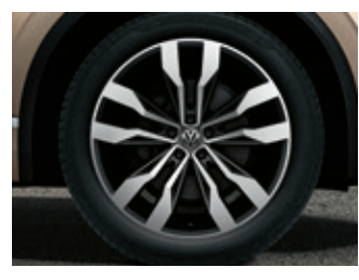
Suzuka 21" alloy wheels (Optional on Executive)