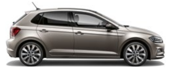
Reflex Silver Metallic