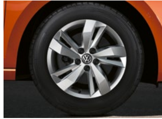
Sassari 15" alloy wheels (Optional on Comfortline)