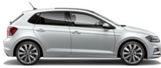
White Silver Metallic