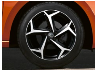
Bonneville 17" alloy wheels (Included in R-Line Package)