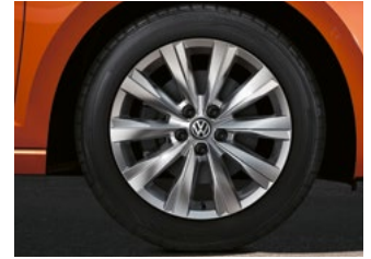
Las Minas 16" alloy wheels (Standard on Highline)