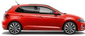
Flash Red Non-Metallic