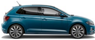
Reef Blue Metallic