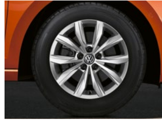
Salou 15" alloy wheels (Standard on Comfortline)