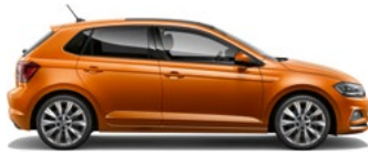
Energetic Orange Metallic