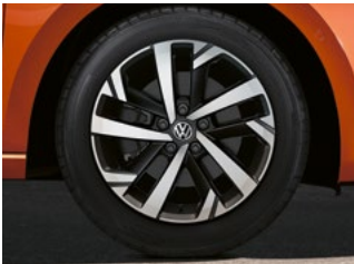
Torsby 16" alloy wheels (Included in beats Package)