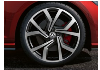
Brescia 18" alloy wheels (Optional on GTI)