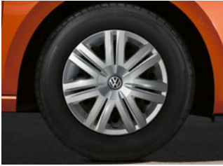
14" steel wheel cover (Standard on Trendline)