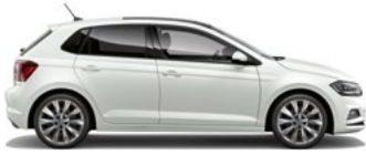
Pure White Non-Metallic

The illustrations on this page can only be regarded as a general guide as the printing process cannot render the true depth and brilliance of the paint finishes with absolute accuracy. Please note that certain paint and trim combinations may not be available.