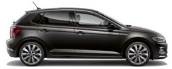
Limestone Grey Metallic