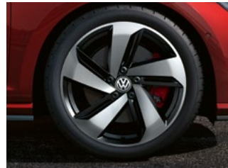
Milton Keynes 17" alloy wheels (Standard on GTI)