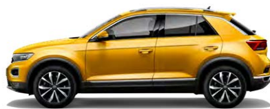
Curcuma Yellow (Only available on Design model) Metallic