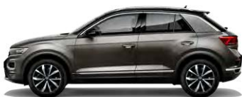
Indium Grey with Black roof Metallic