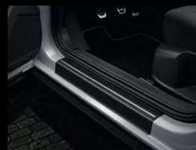
Protective film for the sill rail Front, black / silver