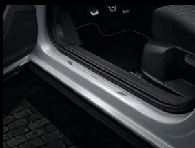
Door strip Front, aluminium, with lettering