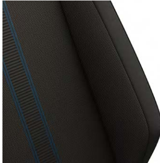
Black – Ravenna Blue – Titanium Black (Optional on Design)