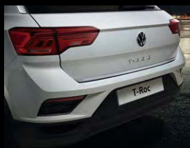
Protective strip for the tailgate Chrome look