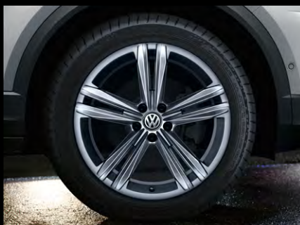
Sebring 18" alloy wheels (Optional on Design models)