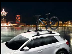
Bicycle holder 17kg, only in conjunction with: Roof bars and supporting rods with T groove profile