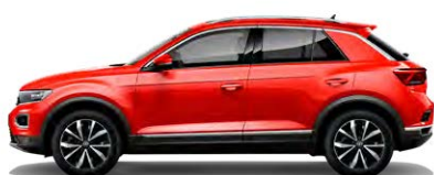
Flash Red Non-Metallic