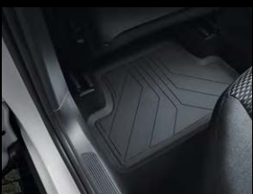
All-weather floor mats Rear, Titanium Black, 1 set = 2 pieces