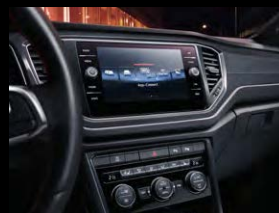
Activation document for AppConnect MirrorLink™, Apple CarPlay™, Android Auto™