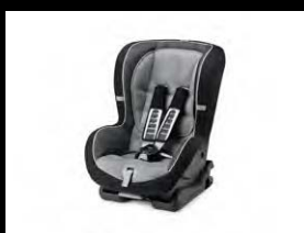
Child seat - 9 to 18 kg G1 Isofix DUO plus top tether