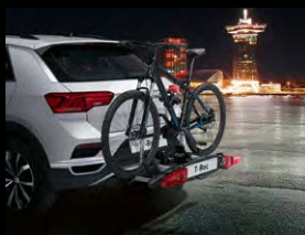
Bicycle carrier for towing hitch 2 bicycles, Premium, folding Load [kg]: 60 Own weight [kg]: 13,0