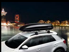
Roof box - 460 litres Comfort, high-gloss black