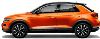
Energetic Orange with Black roof Metallic