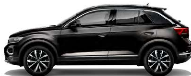
Deep Black Pearl Effect