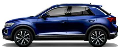
Atlantic Blue Metallic