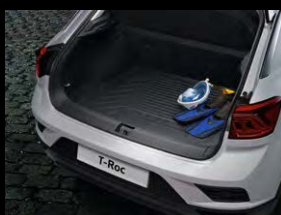
Boot tray Variable loading surface, top position