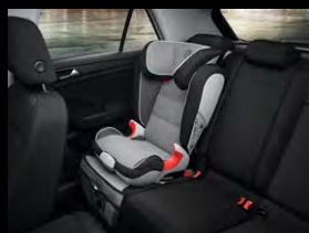
Underlay for child seat system Seat cover