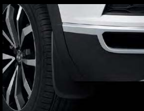
Mud flaps Rear