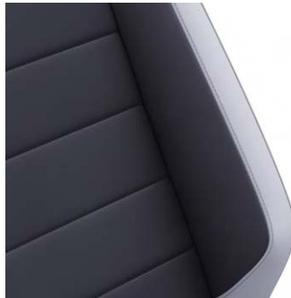
Quartzite – Ceramique – Titanium Black (Standard on R-Line and Optional on Design)