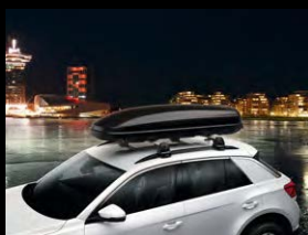
Roof box - 340 litres Matt black