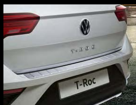
Loading sill protection Plastic, brushed stainless steel look