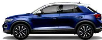
Atlantic Blue with Pure White roof Metallic