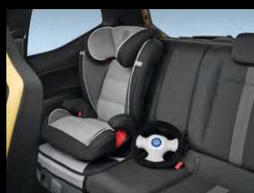
Child seat - 15 to 36 kg G2-3 pro