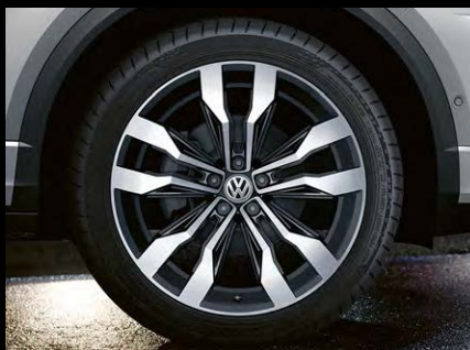
Suzuka 19" alloy wheels (Standard on R-Line model)