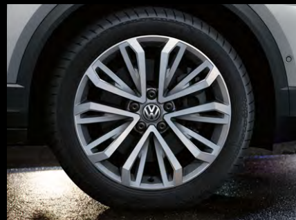
Montego Bay 18" alloy wheels (Optional on Design models)