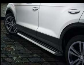
Footboard for the side skirt Transparent