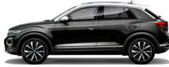
Urano Grey with Pure White roof Non-Metallic