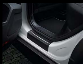
Protective film for the sill rail Rear, black / silver