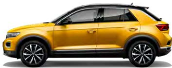
Curcuma Yellow with Black roof Metallic