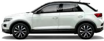
Pure White with Black roof Non-Metallic