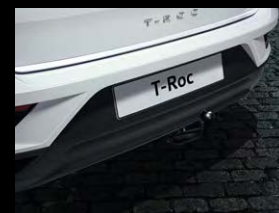
Towing hitch Detachable