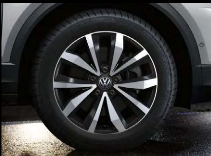
Mayfield 17" alloy wheels (Standard on Design models)

Choose from a variety of options that will ensure your T-Roc is as stylish as it is pleasurable to drive.