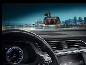
Inside rear-view mirror (Additional) Suction cap mounting