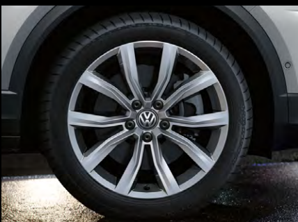
Grange Hill 18" alloy wheels (Optional on Design models)