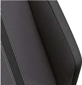
Black Oak – Ceramique – Titanium Black (Optional on Design)