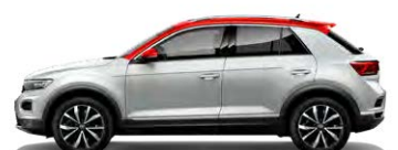
White Silver with Flash Red roof Metallic