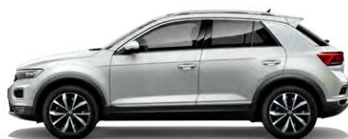
White Silver Metallic