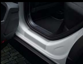
Protective film for the sill rail Rear, transparent