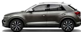
Indium Grey with Pure White roof Metallic