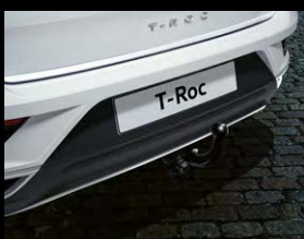
Towing hitch Fixed