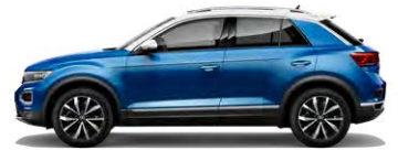
Ravenna Blue with Pure White roof Metallic