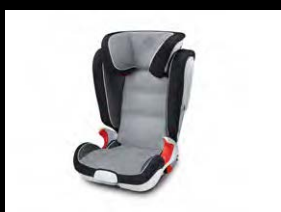
Child seat - 15 to 36 kg G2-3 Isofix backrest removable