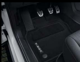
Textile footmat Front and rear, with T-Roc lettering, 1 set = 4 pieces