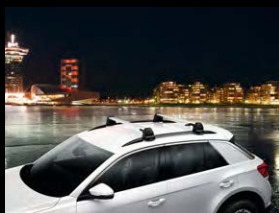
Supporting rods T-groove