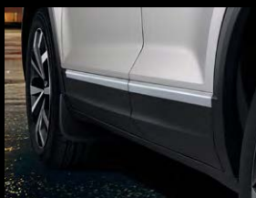
Mud flaps Front