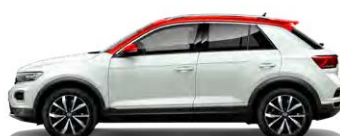
Pure White with Flash Red roof Non-Metallic