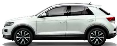
Pure White Non-Metallic