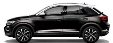
Deep Black with Pure White roof Pearl Effect