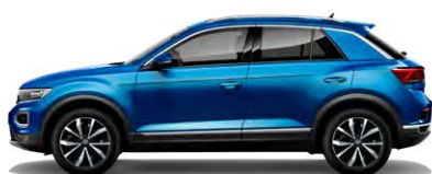
Ravenna Blue Metallic