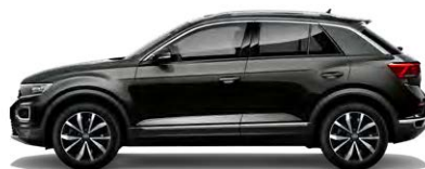
Urano Grey Non-Metallic