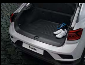
Boot inlay Variable loading surface, top position