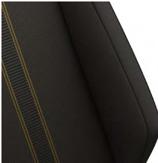
Black – Curcuma Yellow – Titanium Black (Optional on Design)