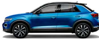
Ravenna Blue with Black roof Metallic