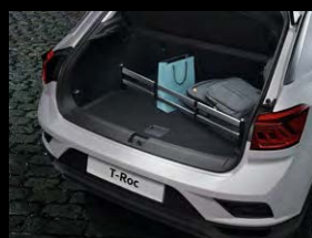
Cargo liner Luggage compartment plug-in module