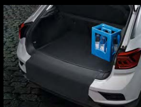
Boot mat Reversible velour/plastic nubs, vehicles with variable loading surface