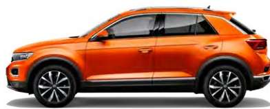
Energetic Orange (Only available on Design model) Metallic