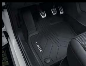
All-weather floor mats Front, Titanium Black, right-hand drive