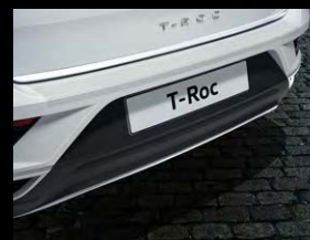
Loading sill protection Transparent