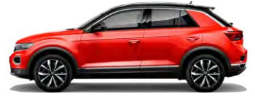
Flash Red with Black roof Non-Metallic