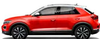
Flash Red with Pure White roof Non-Metallic