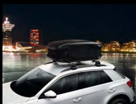
Roof box - 300-500 litres Urban loader, matt black