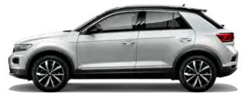
White Silver with Black roof Metallic