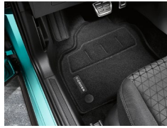
All-weather floor mats Rear, Titanium Black