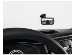
Inside rear-view mirror (Additional) - Suction cap mounting