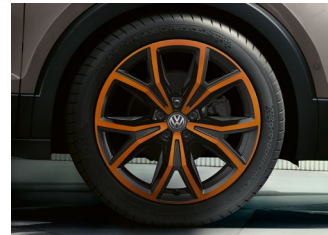
Cologne in Orange 18" alloy wheels (Optional on Highline Design Package in Energetic Orange)