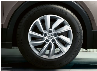
Belmont 16" alloy wheels (Standard on Comfortline)