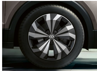
Manila 17" alloy wheels (Optional on Comfortline with R-Line)