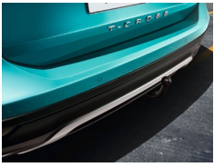
Towing hitch (kit) Fixed, incl. 13-pin electrical installation kit