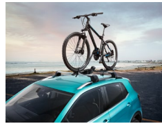
Bicycle holder - for bicycle frames of up to 100 mm (oval)/80 mm (round)