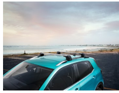
Supporting rods Thule, T-groove