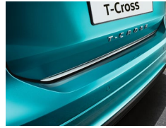
Protective strip for the tailgate Chrome look