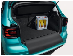
Boot mat Reversible velour / plastic nubs, vehicles with variable luggage compartment floor