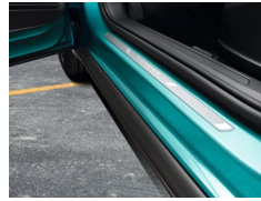
Door strip Front, aluminium, with lettering