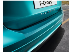
Loading sill protection Transparent