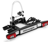
Bicycle carrier for the towing hitch 2 bicycles