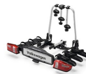
Bicycle carrier for the towing hitch 3 bicycles