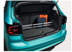
Cargo liner Luggage compartment plug-in module