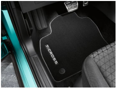
Textile floor mats Front and rear, black, premium with lettering