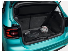
Luggage net for luggage compartment Only in combination with load lashing rings