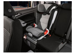
Underlay for child seat system Seat cover