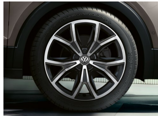
Cologne 18" alloy wheels (Standard on Highline)