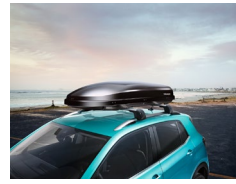
Roof box - 340 litres Matt Black