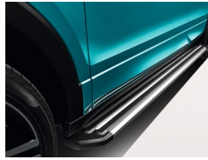
Footboard for the side skirt Aluminium, with non-slip inserts