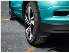
Mud flaps Front and rear