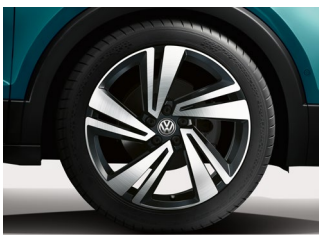
Nevada 18" alloy wheels (Optional on Highline with R-Line and Standard on 1.5 TSI R-Line)