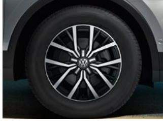
Tulsa 17" alloy wheels (Standard on Comfortline)