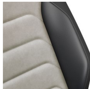
Art Velours Storm Grey