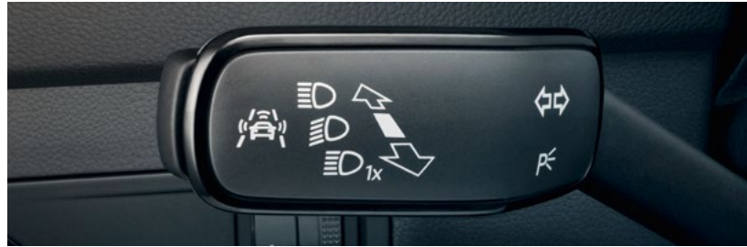
Adaptive Cruise Control with Front Assist (forward collision warning)

When ACC is activated, the vehicle automatically brakes and accelerates in a speed range set by the driver. If another vehicle approaches, the ACC brakes the car to the same speed and maintains the pre-selected distance.