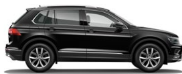
Deep Black Pearl Effect