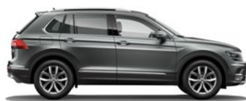
Indium Grey Metallic