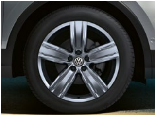
Victoria Falls 19" alloy wheels (Optional on all trim lines)