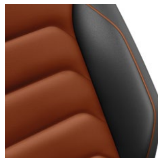
Vienna Safrano Orange / Titanium Black