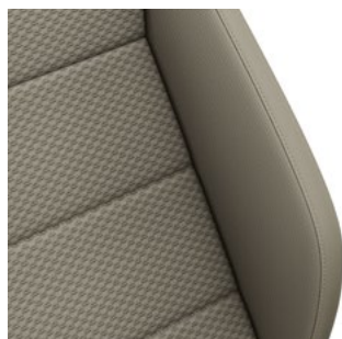
Lasano Storm Grey (Tiguan Allspace only)