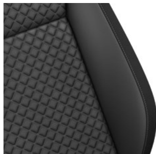
Rhombus Titanium Black / Storm Grey