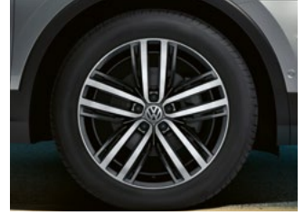
Auckland 19" alloy wheels (Optional on Trendline (Tiguan only), Comfortline and Highline)