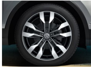
Suzuka 20" alloy wheels (Optional on Highline only with R-Line)