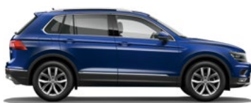
Atlantic Blue Metallic