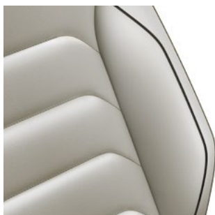
Vienna Storm Grey