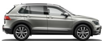
Tungsten Silver Metallic