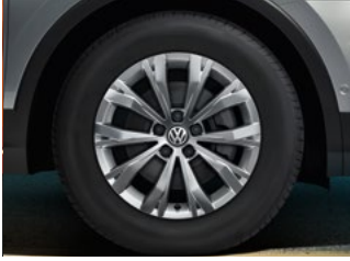
Montana 17" alloy wheels (Standard on Trendline)