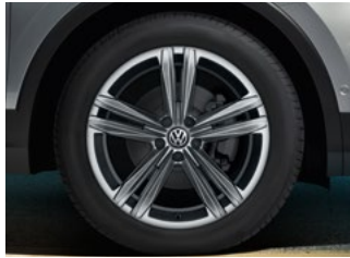
Sebring 19" alloy wheels (Optional on Comfortline only with R-Line)