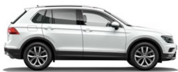
Pure White Solid

The illustrations on this page can only be regarded as a general guide as the printing process cannot render the true depth and brilliance of the paint finishes with absolute accuracy. Please note that certain paint and trim combinations may not be available.