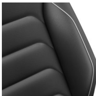
Vienna Titanium Black