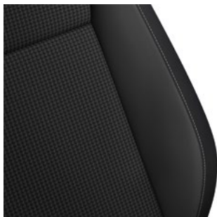
Microdot Titanium Black (Tiguan only)