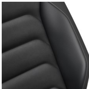
Art Velours Titanium Black