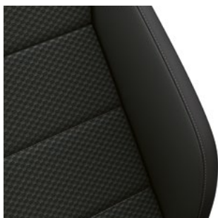
Lasano Titanium Black (Tiguan Allspace only)