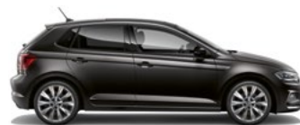
Limestone Grey Metallic