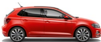
Flash Red Non-Metallic