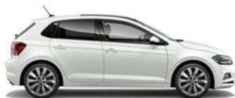
Pure White Non-Metallic

The illustrations on this page can only be regarded as a general guide as the printing process cannot render the true depth and brilliance of the paint finishes with absolute accuracy. Please note that certain paint and trim combinations may not be available.