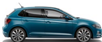
Reef Blue Metallic