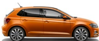
Energetic Orange Metallic