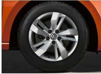
Sassari 15" alloy wheels (Optional on Comfortline)