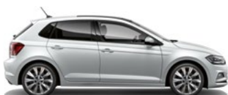
White Silver Metallic