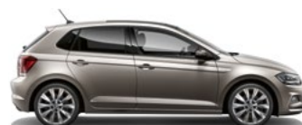
Reflex Silver Metallic