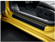
Protective film For side sill front and rear doors, black with silver stripe