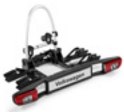
Bicycle carrier for the towing hitch 2 bicycles