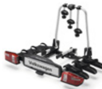
Bicycle carrier for the towing hitch 3 bicycles