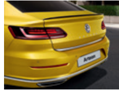
Protective strip for tailgate Chrome look