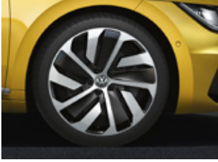
Montevideo 19" alloy wheels (R-Line - standard)