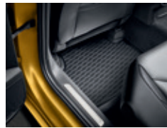
All-weather mat rear Titanium Black