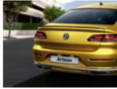
Rear spoiler High-gloss black