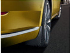
Front Mud Flap