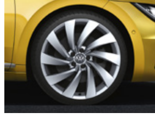
Rosario 20" alloy wheels (R-Line - optional)