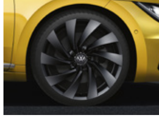
Rosario Dark Graphite 20" alloy wheels (R-Line - optional)