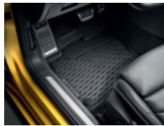
All-weather mat front Titanium Black