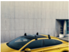
Roof bar set