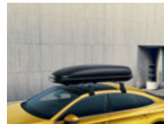
Roof box - 340 litres Matt Black