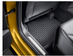
All-weather mat rear Titanium Black