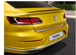
Towing hitch (kit)