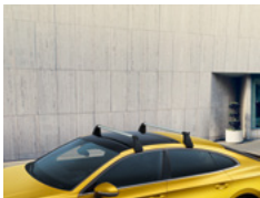
Roof bar set