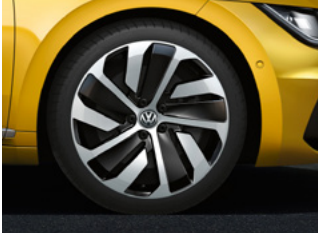
Montevideo 19" alloy wheels (R-Line – standard)