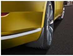
Front Mud Flap