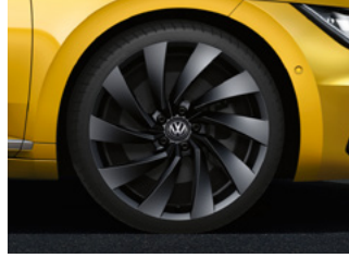
Rosario Dark Graphite 20" alloy wheels (R-Line - optional)