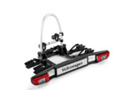
Bicycle carrier for the towing hitch 2 bicycles