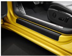
Protective film For side sill front and rear doors, black with silver stripe