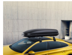
Roof box - 340 litres Matt Black