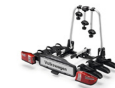
Bicycle carrier for the towing hitch 3 bicycles