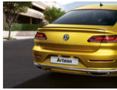
Rear spoiler High-gloss black