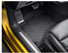
All-weather mat front Titanium Black