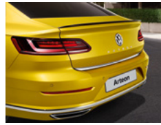
Protective strip for tailgate Chrome look