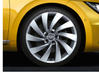
Rosario 20" alloy wheels (R-Line - optional)