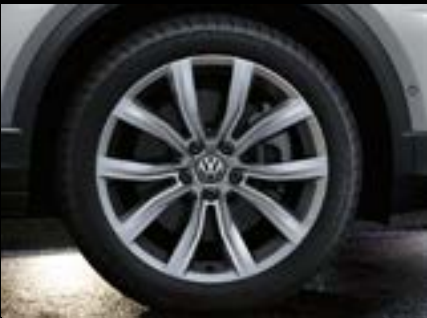
Grange Hill 18" alloy wheels (Optional on Design models)