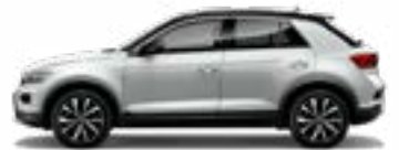
White Silver with Black roof Metallic