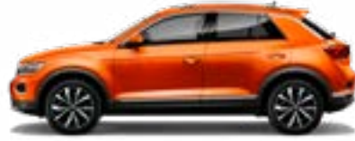
Energetic Orange (Only available on Design model) Metallic