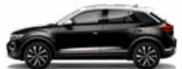
Deep Black with Pure White roof Pearl Effect