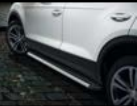
Footboard for the side skirt Transparent