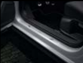
Door strip Front, aluminium, with lettering