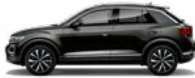
Urano Grey Non-Metallic