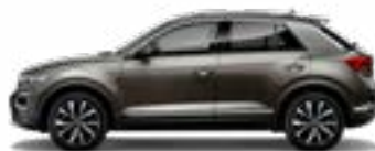
Indium Grey with Pure White roof Metallic