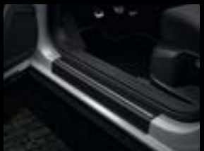
Protective film for the sill rail Front, black / silver