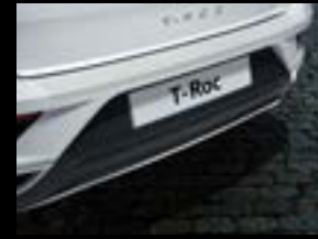
Loading sill protection Transparent