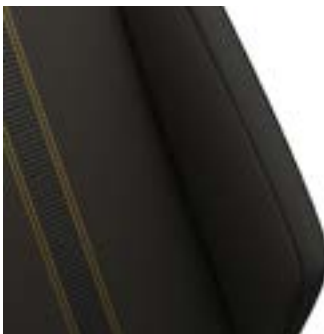
Black – Curcuma Yellow – Titanium Black (Optional on Design)