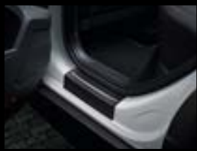
Protective film for the sill rail Rear, black / silver