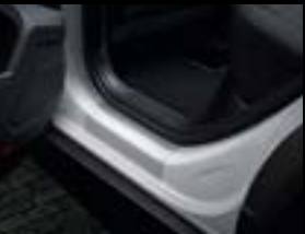
Protective film for the sill rail Rear, transparent