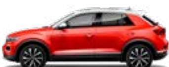
Flash Red with Pure White roof Non-Metallic