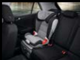
Underlay for child seat system Seat cover