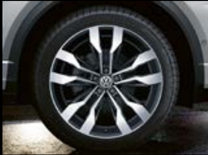
Suzuka 19" alloy wheels (Standard on R-Line model)