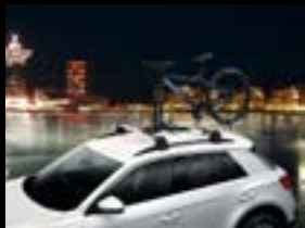
Bicycle holder 17kg, only in conjunction with: Roof bars and supporting rods with T groove profile