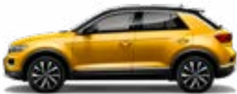
Curcuma Yellow with Black roof Metallic