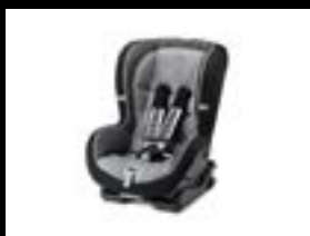
Child seat - 9 to 18 kg G1 Isofix DUO plus top tether