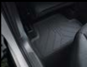
All-weather floor mats Rear, Titanium Black, 1 set = 2 pieces