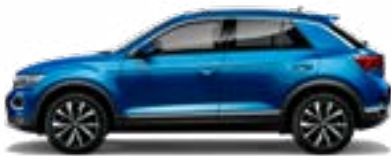
Ravenna Blue Metallic