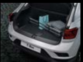
Cargo liner Luggage compartment plug-in module