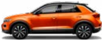
Energetic Orange with Black roof Metallic