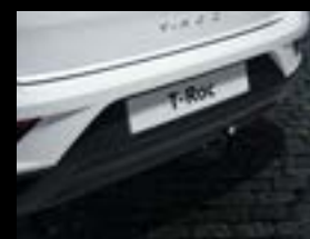
Towing hitch Detachable