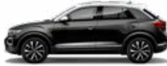
Urano Grey with Pure White roof Non-Metallic