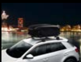
Roof box - 300-500 litres Urban loader, matt black