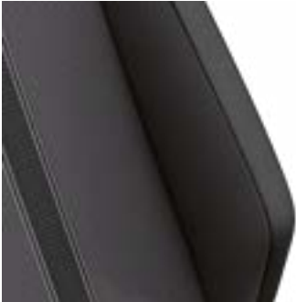
Black Oak – Ceramique – Titanium Black (Optional on Design)