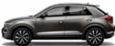
Indium Grey Metallic