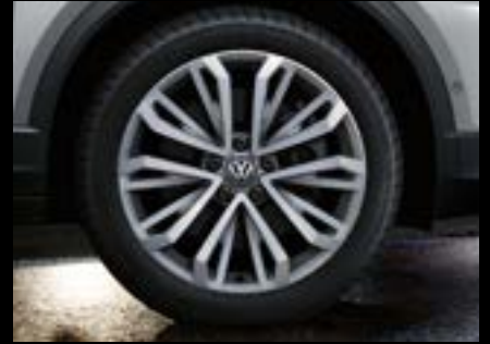
Montego Bay 18" alloy wheels (Optional on Design models)