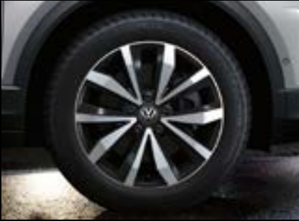
Mayfield 17" alloy wheels (Standard on Design models)

Choose from a variety of options that will ensure your T-Roc is as stylish as it is pleasurable to drive.