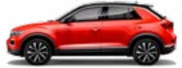
Flash Red with Black roof Non-Metallic