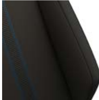
Black – Ravenna Blue – Titanium Black (Optional on Design)