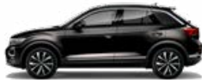
Deep Black Pearl Effect