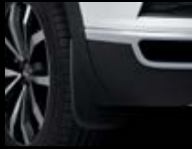
Mud flaps Rear