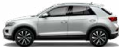
White Silver Metallic