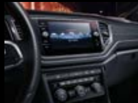
Activation document for AppConnect MirrorLink™, Apple CarPlay™, Android Auto™