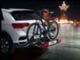
Bicycle carrier for towing hitch 2 bicycles, Premium, folding Load [kg]: 60 Own weight [kg]: 13,0