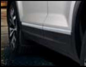
Mud flaps Front