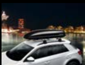
Roof box - 460 litres Comfort, high-gloss black