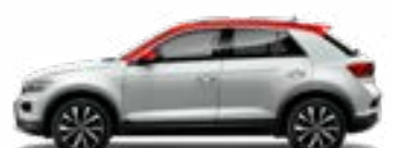
White Silver with Flash Red roof Metallic