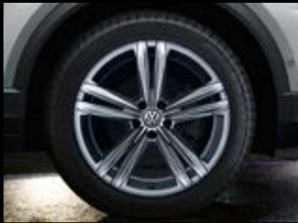
Sebring 18" alloy wheels (Optional on Design models)