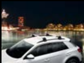
Supporting rods T-groove