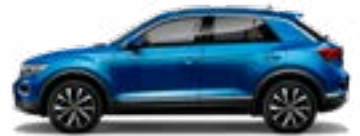
Ravenna Blue with Pure White roof Metallic