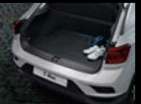
Boot inlay Variable loading surface, top position