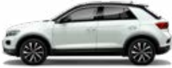
Pure White with Black roof Non-Metallic