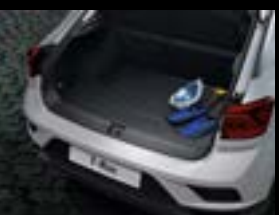
Boot tray Variable loading surface, top position