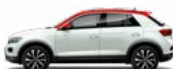
Pure White with Flash Red roof Non-Metallic