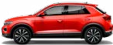
Flash Red Non-Metallic