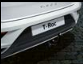
Towing hitch Fixed