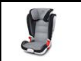
Child seat - 15 to 36 kg G2-3 Isofix backrest removable