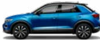
Ravenna Blue with Black roof Metallic