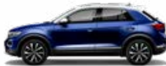
Atlantic Blue with Pure White roof Metallic