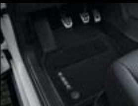
Textile footmat Front and rear, with T-Roc lettering, 1 set = 4 pieces