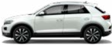
Pure White Non-Metallic