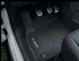
All-weather floor mats Front, Titanium Black, right-hand drive