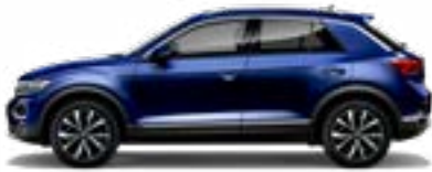
Atlantic Blue Metallic