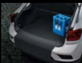
Boot mat Reversible velour/plastic nubs, vehicles with variable loading surface