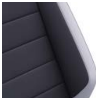
Quartzite – Ceramique – Titanium Black (Standard on R-Line and Optional on Design)