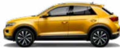
Curcuma Yellow (Only available on Design model) Metallic