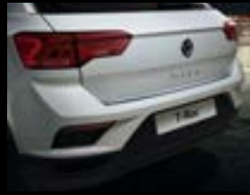
Protective strip for the tailgate Chrome look