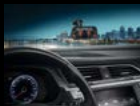
Inside rear-view mirror (Additional) Suction cap mounting