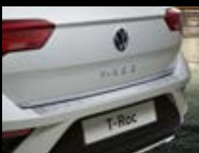
Loading sill protection Plastic, brushed stainless steel look