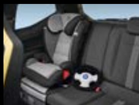
Child seat - 15 to 36 kg G2-3 pro