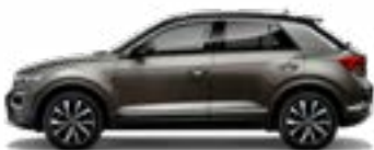
Indium Grey with Black roof Metallic