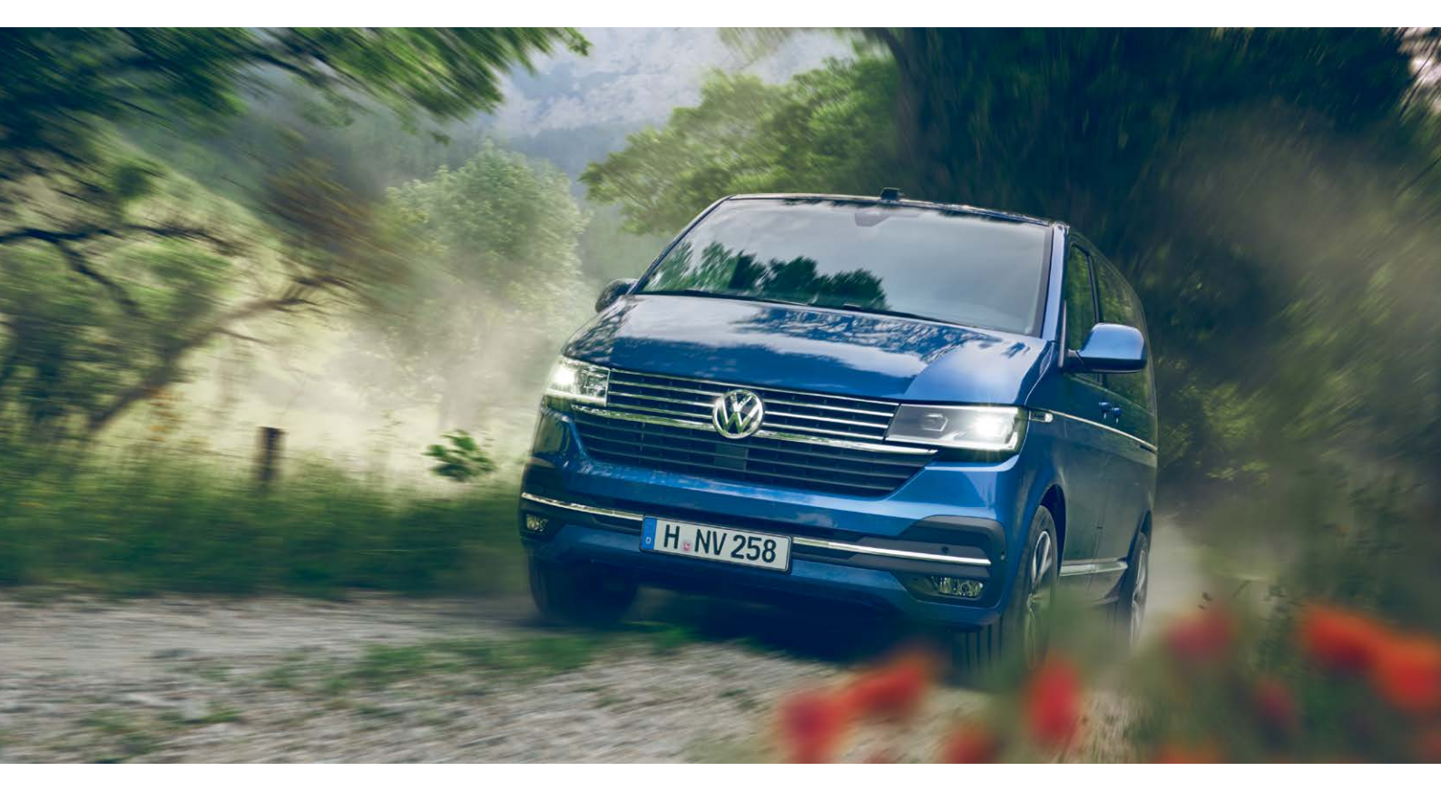
Local vehicle specifications may differ from model shown.

Quality is tradition with the T6.1 range.