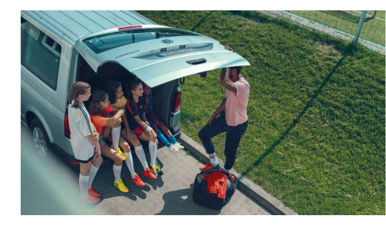
\label{local problem} \mbox{Local vehicle specifications may differ from model shown.}

Whether it's after a soccer match, the school run, or on the way to work. Muddy shoes? The rubber floor covering can be cleaned easily. Dirty hands? The interior trim can be wiped clean. Going on a short break? The tailgate provides shelter from sunshine and rain.