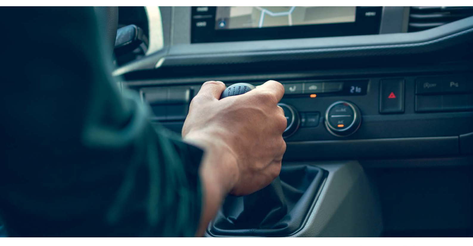
Local vehicle specifications may differ from model shown.