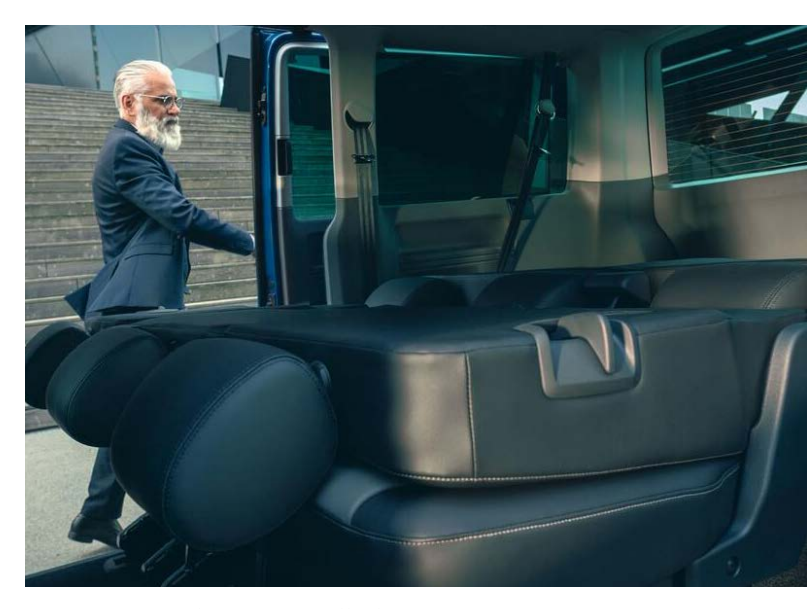
Local vehicle specifications may differ from model shown.

The efficient driver workplace, electromechanical power steering, newly designed dashboard, driver's seat with lumbar support and excellent all-round visibility ensure a relaxed, stress-free driving experience.