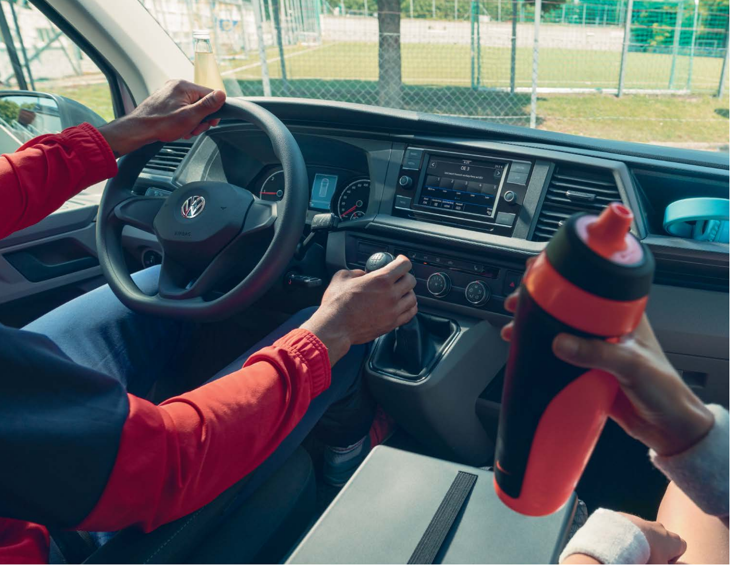
Local vehicle specifications may differ from model shown.