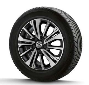
"Aracaju Black diamond-turned" Trendline Plus 146kW alloy wheel 17" (Standard)