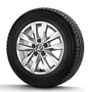
"Clayton Silver" Trendline 81kW alloy wheel 16" (Standard)