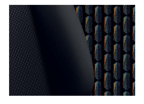
"Bricks" cloth in Titanium Black