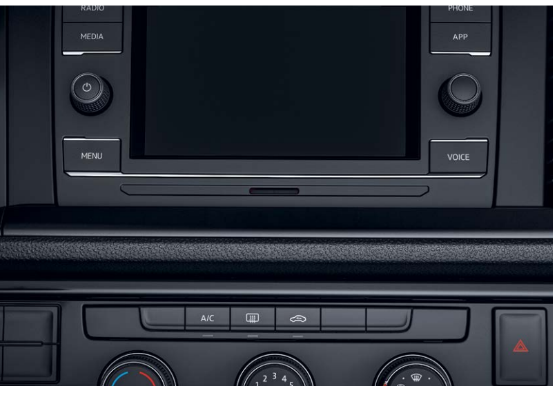
International model shown, local specification might differ.