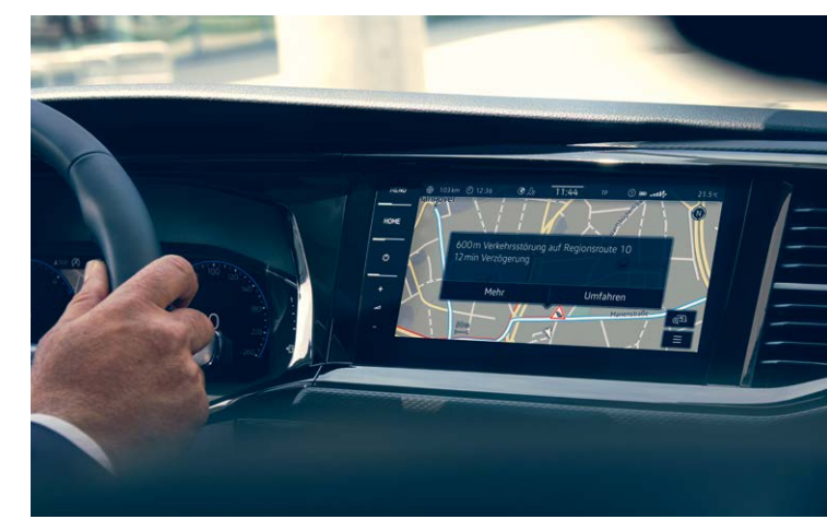
Local vehicle specifications may differ from model shown.

State-of-the-art driver assist systems include: Crosswind and Park Distance Control, Post-collision Braking System and Tyre Pressure Monitor. Side and curtain airbags for the driver, front passenger and rear passenger compartment are optional. Windshield wiper intermittent control with rain sensor and washer fluid level indicator. Rear-view camera comes standard.