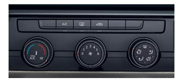
All Kombi versions include a radio system, interior lighting with LED technology and Climatic semi-automatic air conditioning. Climatronic air conditioning comes standard on the 146kW model.