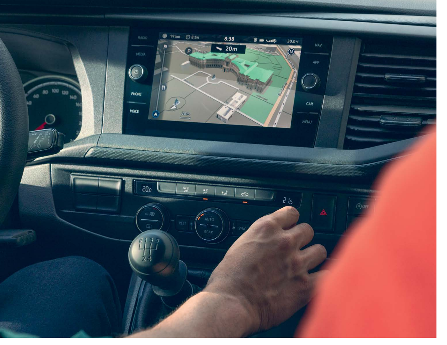
Local vehicle specifications may differ from model shown.