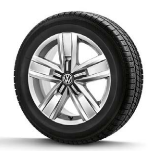
"Devonport Silver" Trendline 110kW alloy wheel 17" (Standard)