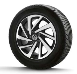
"Woodstock Black diamond – turned" Trendline Plus 146kW only alloy wheel (Optional on 146kW)

Alloy Wheels available in 16" and 17" Alloy on the Kombi Range