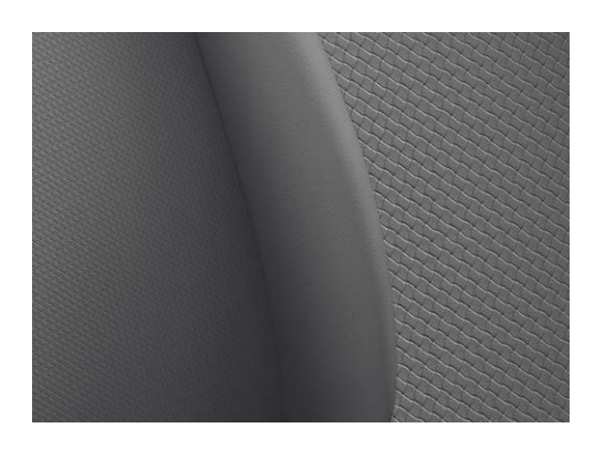
"Mesh" leather in Palladium

Please note: Not all upholstery combinations can be ordered together, and, in some instances, certain combinations may incur extra cost.