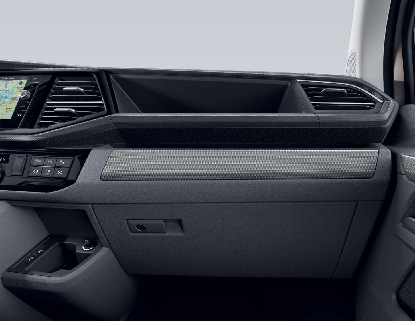
Local vehicle specifications may differ from model shown.