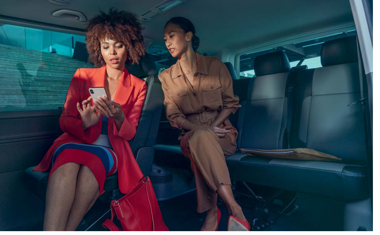
Local vehicle specifications may differ from model shown.