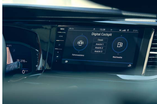
Kombi 6.1 is available to order with the optional Digital Cockpit, which features a high-resolution 10.25-inch display. It also features the latest touch-screen radio and navigation systems with App-Connect, WeConnect Go and Bluetooth®, to keep you informed while you're on the move.

Local vehicle specifications may differ from model shown.