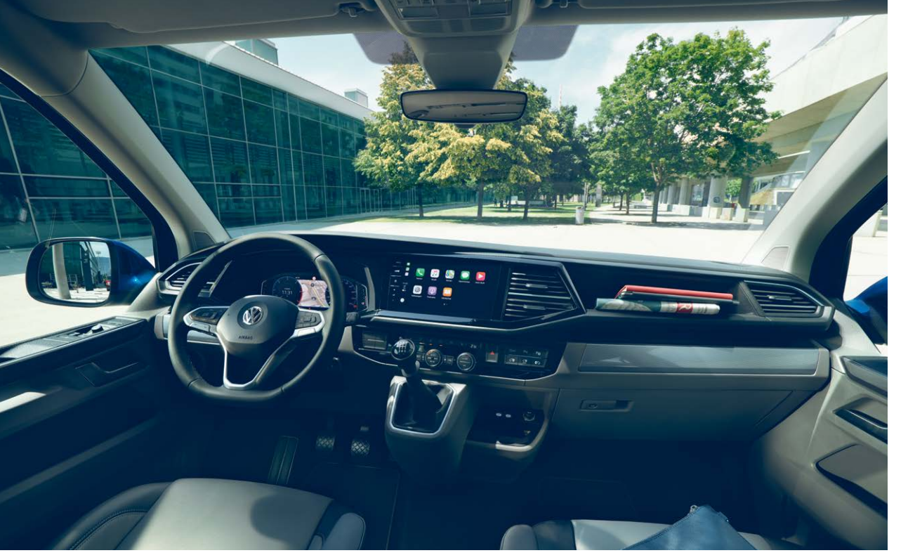
Local vehicle specifications may differ from model shown.