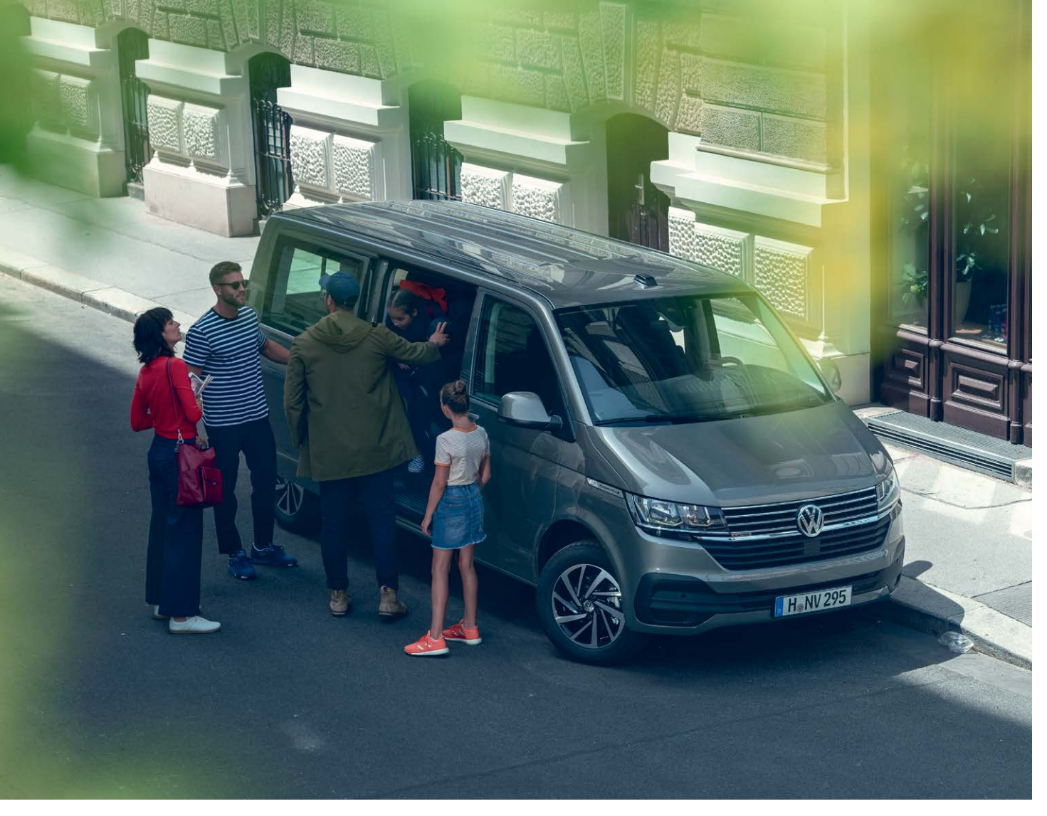
Local vehicle specifications may differ from model shown.