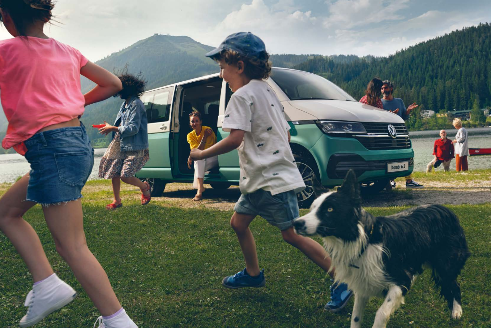
*Availability of exterior paint finishes will vary from images shown.