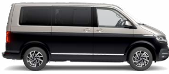
Mojave Beige/ Deep Black