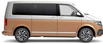
*Candy White/ Copper Bronze