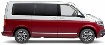
Reflex Silver/ Fortana Red