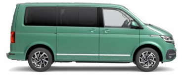
*Bay Leaf Green