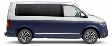
Reflex Silver/ Starlight Blue