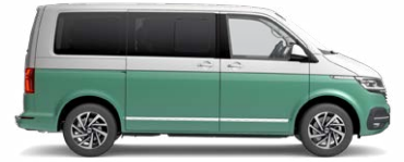
*Candy White/ Bay Leaf Green