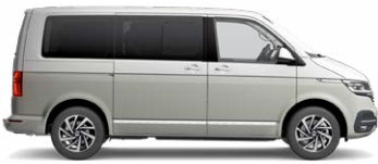
Candy White/ Ascot Grey

*Availability of exterior paint finishes will vary from images shown.