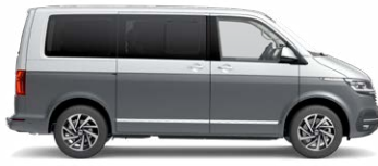
Reflex Silver/ Indium Grey