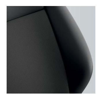
Mesh Leatherette seat upholstery Titanium Black Optional