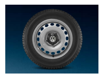
Steel Wheel 6 J x 15 with 195/65 R15 tyre (Standard on short wheelbase models only)