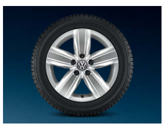
Bendigo Alloy wheels 6 J x 16 with 205/55 R16 tyre (Optional on all Crew Bus models)