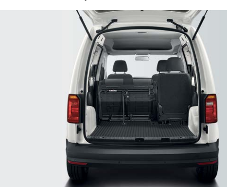
Tailgate with glass windows for the Caddy Crew Bus (optional).

Rear wing doors (<sup>2</sup>/<sub>3</sub> to <sup>1</sup>/<sub>3</sub>) with glass windows come standard on the Caddy Crew Bus.