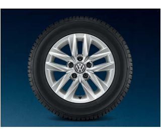
Caloundra Alloy wheels 6 J x 15 with 195/65 R15 tyre (Optional on short wheelbase models only)