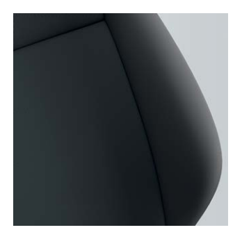
Austin Cloth seat upholstery Titanium Black Standard