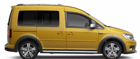
Sandstorm Yellow Metallic