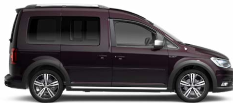
Black Berry Metallic