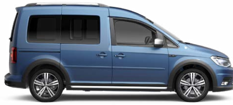
Acapulco Blue Metallic