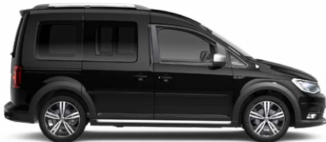
Deep Black Pearl