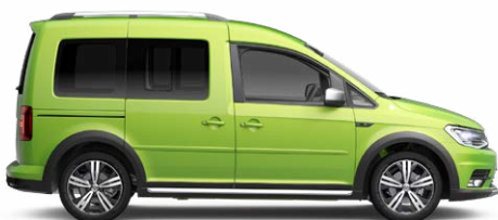
Viper Green Metallic