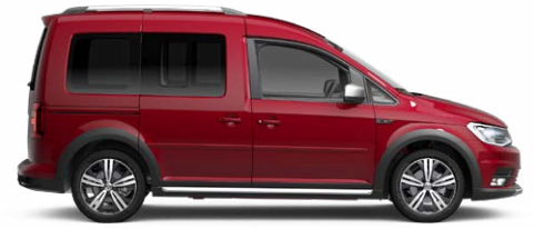
Fortana Red Metallic