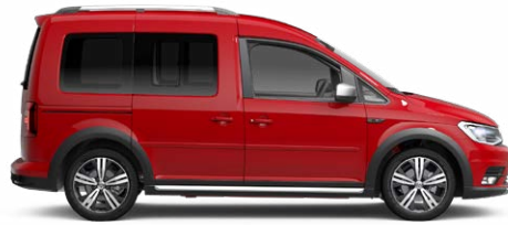
Cherry Red Solid