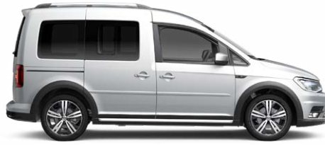
Reflex Silver Metallic