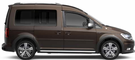
Chestnut Brown Metallic