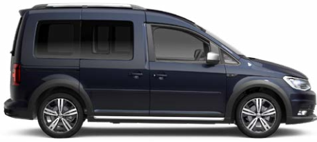
Starlight Blue Metallic