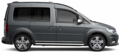
Indium Grey Metallic