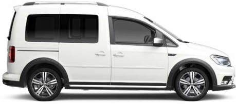
Candy White Solid