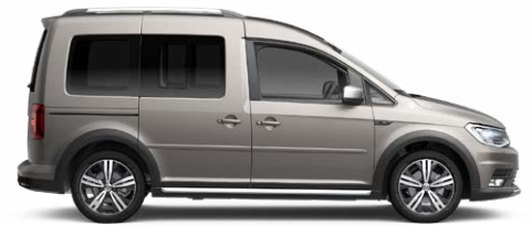
Mojave Beige Metallic