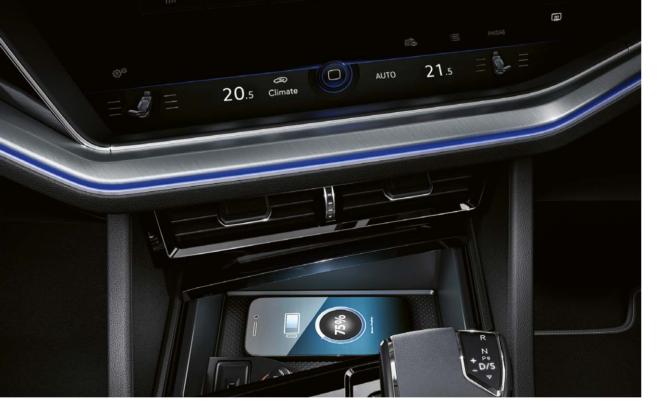
Ambient Lighting & Climate Control