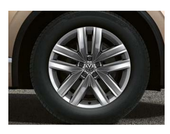
Esperance 19" alloy wheels (Standard on Luxury)