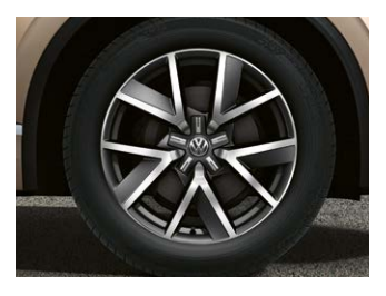
Braga 20" alloy wheels (Standard on Executive)