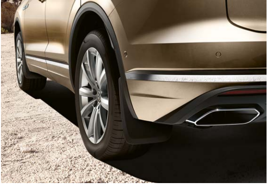
There's no mistaking the Touareg, with its distinctive contours and assertive lines working in tandem to direct you towards its extended bonnet. Its tail light clusters create an attractive rear design of chrome trapezoid tailpipes on either side, while the roof rails offer more versatility when required.