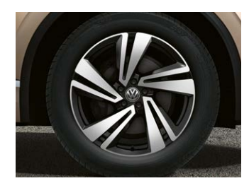
Nevada 20" alloy wheels (Optional on the Luxury model when the R-Line Package is seleceted)