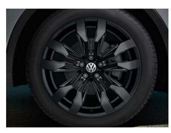
Black Suzuka 21" alloy wheels (Only with Black Style Package -Optional on Executive)