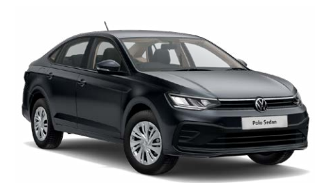
Carbon Steel Gray Metallic