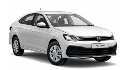
Candy White Solid

The illustrations on this page can only be regarded as a general guide as digital rendering cannot capture the true depth and brilliance of the paint finishes with absolute accuracy. Please note that certain paint and trim combinations may not be available.