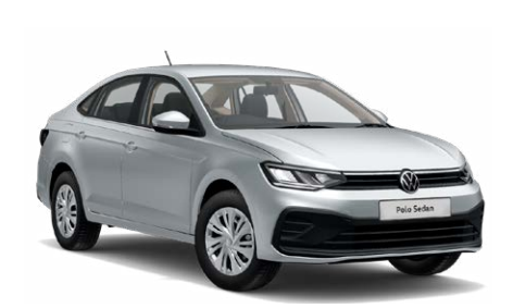
Reflex Silver Metallic