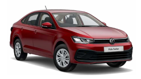
Wild Cherry Red Metallic