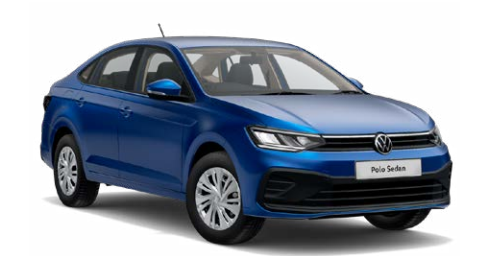
Rising Blue Metallic