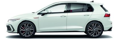
Pure White (Available on Golf GTI and R)