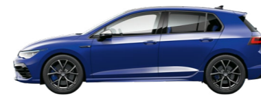
Lapiz Blue (Available on Golf R)