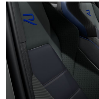
"Nappa Leather" (Standard on R)