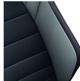
"Vienna leather" (Standard on GTI)