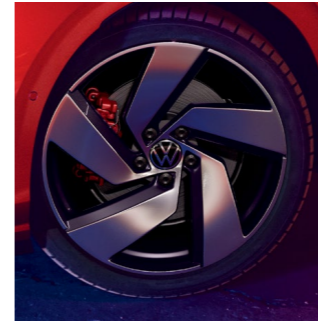
Richmond 7.5J x 18" alloy wheels (Standard on GTI)