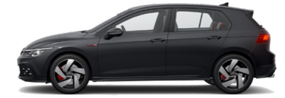
Dolphin Grey (Available on Golf GTI)