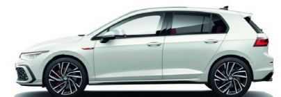
Oryx White (Available on Golf GTI)