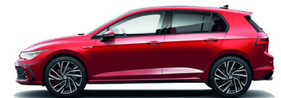
Kings Red (Available on Golf GTI)