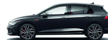
Deep Black Pearl (Available on Golf GTI and R)