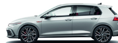
Reflex Silver (Available on Golf GTI)