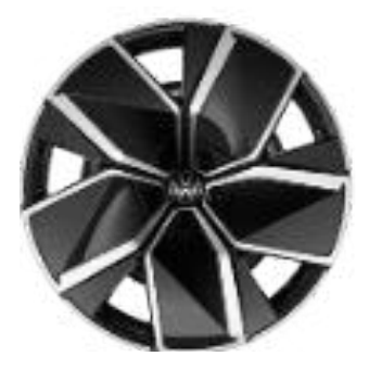
18" Leeds, Diamond-turned surface (Optional on R-Line)