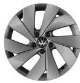
17" Nottingham, silver (Optional on Life and Life Plus)