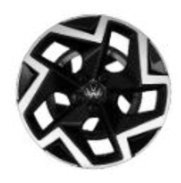
17" Coventry, Diamond-turned surface (Standard on R-Line)