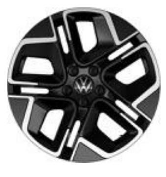
18" Black style, York Diamond-turned surface (Optional on R-Line Plus)