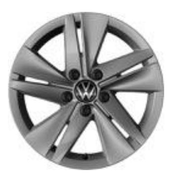
16" Norfolk, silver (Standard on Life and Life Plus)