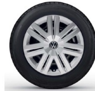
14" Steel wheel cover (Standard on Base)