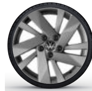
15" Ronda Alloy (Optional on Base)