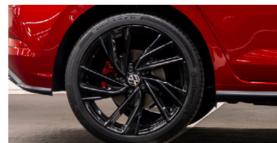
18" Adelaide alloy wheels in black Rear diffuser in black