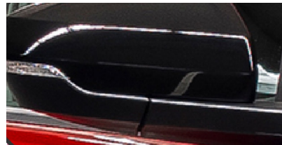
Exterior mirror housing painted in black