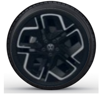
17" York Alloy (Optional on R-Line)