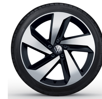
17" Milton Keynes Alloy (Standard on GTI)