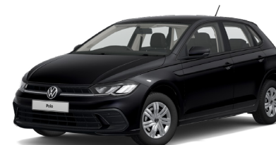
Deep Black Pearl