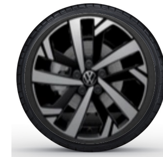
16" Torsby Alloy (Optional on Life)