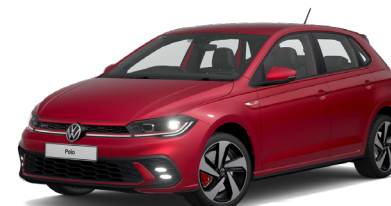
Kings Red (GTI only)