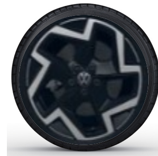
16" Coventry Alloy (Standard on R-Line)