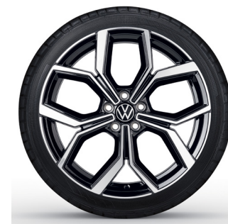
18" Faro Alloy (Optional on GTI)