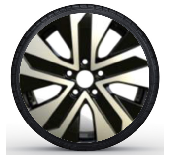
15" Everest Alloy (Standard on Life)