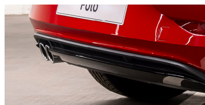
Tinted rear windows from B Pillar backwards