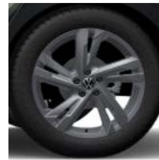
17" Valencia Alloy (Standard on R-Line)