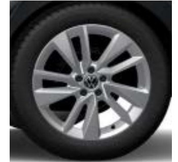
17" Bangalore Alloy (Optional on Life)