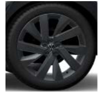
18" Funchal Alloy (Optional on Style)