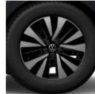
16" Everett Alloy (Optional on Life)