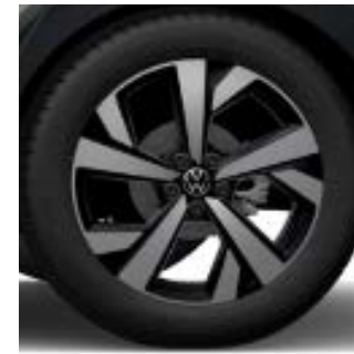
17" Aberdeen Alloy (Standard on Style)