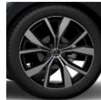
18" Misano Alloy (Optional on R-Line)