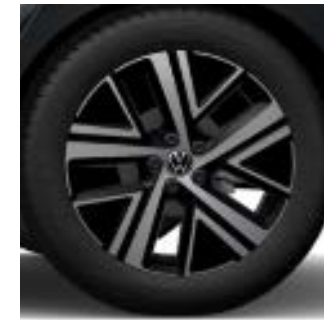
17" Tokio Alloy (Optional on Style)