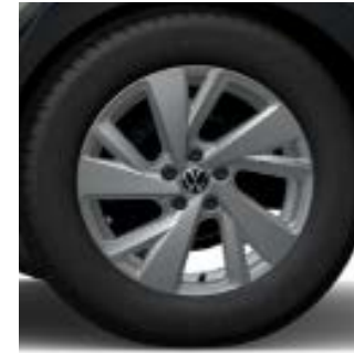
16" Belmopan Alloy (Standard on Life)