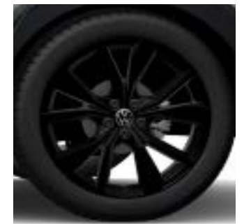
18" Misano Alloy (Available with Black Styling Package on R-Line)