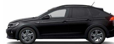
Deep Black Pearl