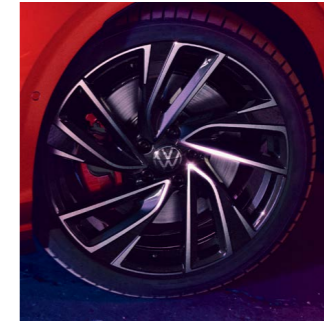
Adelaide 8J x 19" alloy wheels (Optional on GTI)