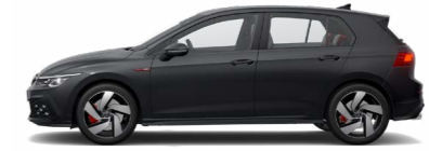
Dolphin Grey (Available on Golf GTI)