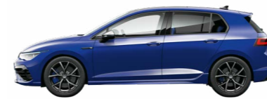
Lapiz Blue (Available on Golf R)