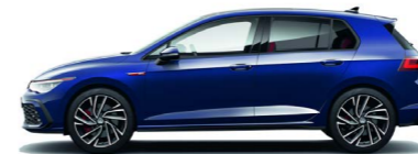
Atlantic Blue (Available on Golf GTI)