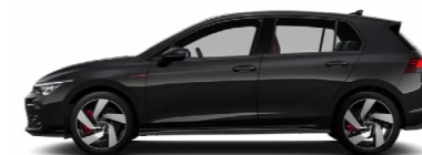
Grenadilla Black (Available on Golf GTI and R)