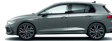
Moonstone Grey (Available on Golf GTI)