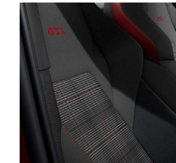
"Jacara Cloth" (Standard on GTI Jacara Edition)