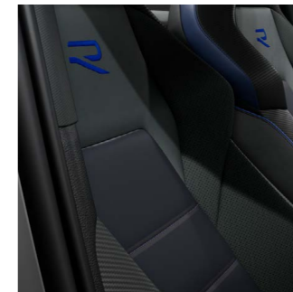
"Nappa Leather" (Standard on R)