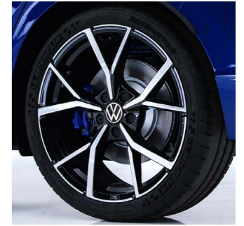
Estoril 8J x 19" alloy wheels (Standard on R)