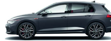
Urano Grey (Available on Golf GTI)