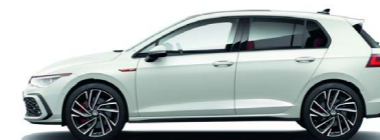
Oryx White (Available on Golf GTI)