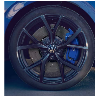
Estoril black 8J x 19" black alloy wheels (Option with black performance package)