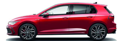
Kings Red (Available on Golf GTI)