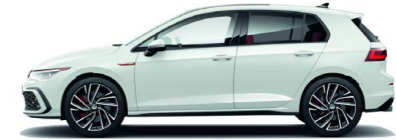
Pure White (Available on Golf GTI and R)