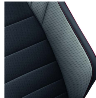
"Vienna leather" (Standard on GTI)