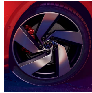
Richmond 7.5J x 18" alloy wheels (Standard on GTI)