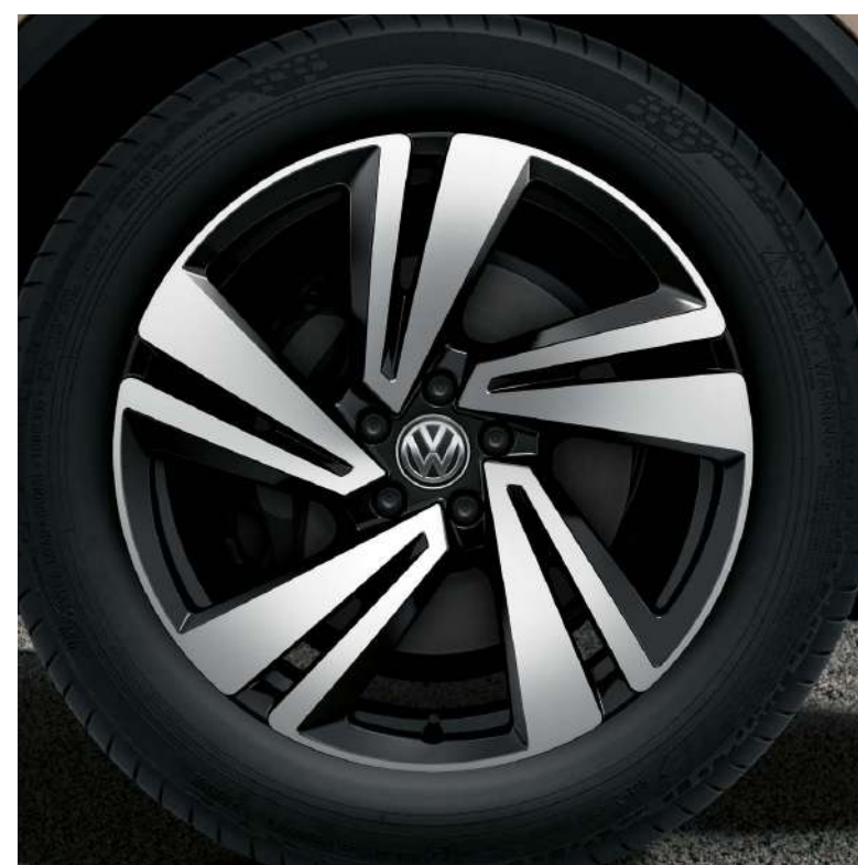
20" Nevada Alloy (Optional on Luxury)