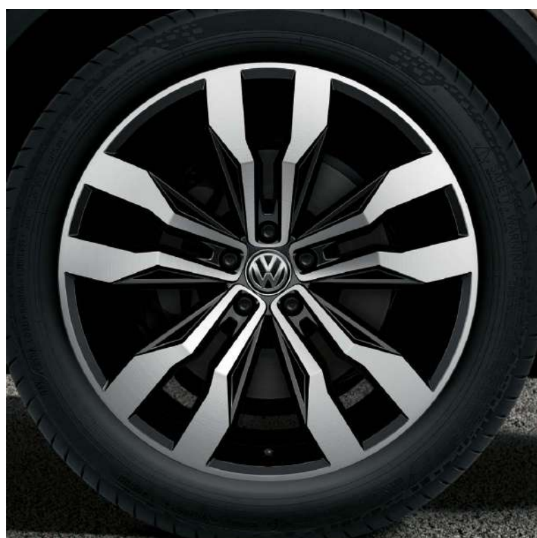
21" Suzuka Alloy (Optional on Executive)