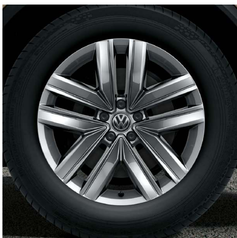
19" Esperance Alloy (Standard on Luxury)