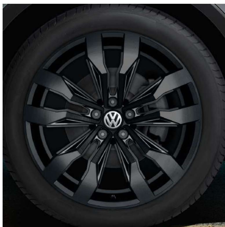
21" Black Suzuka Alloy (Optional on Executive with Black Style Package)