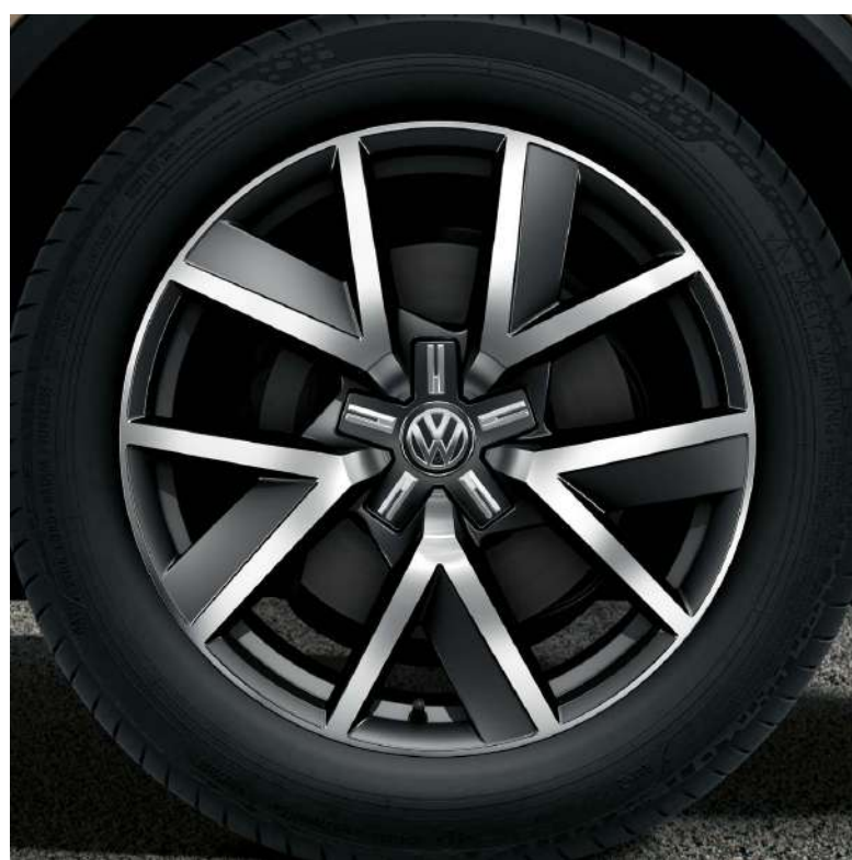
20" Braga Alloy (Standard on Executive)