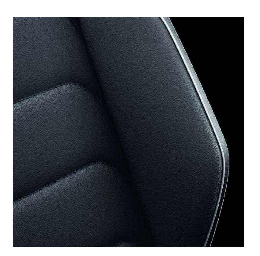
"Vienna" leather (Optional on Life and standard on Style)