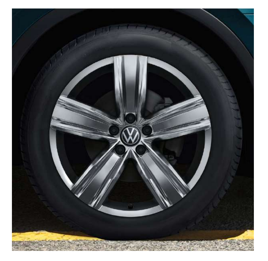
19" Victoria Falls Alloy (Optional on Life)