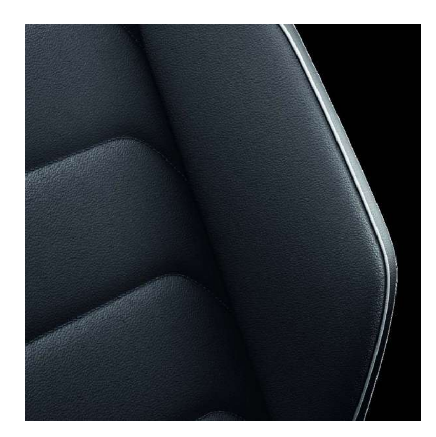
"Vienna" R-Line Logo in Front (Standard on R-Line)