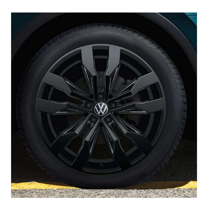
20" Suzuka Black Alloy (Optional with Black Style