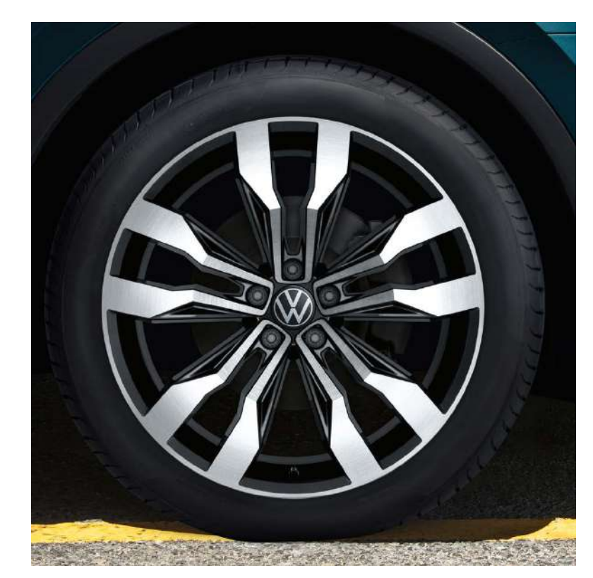
20" Suzuka Dark Graphite Alloy (Optional on R-Line)