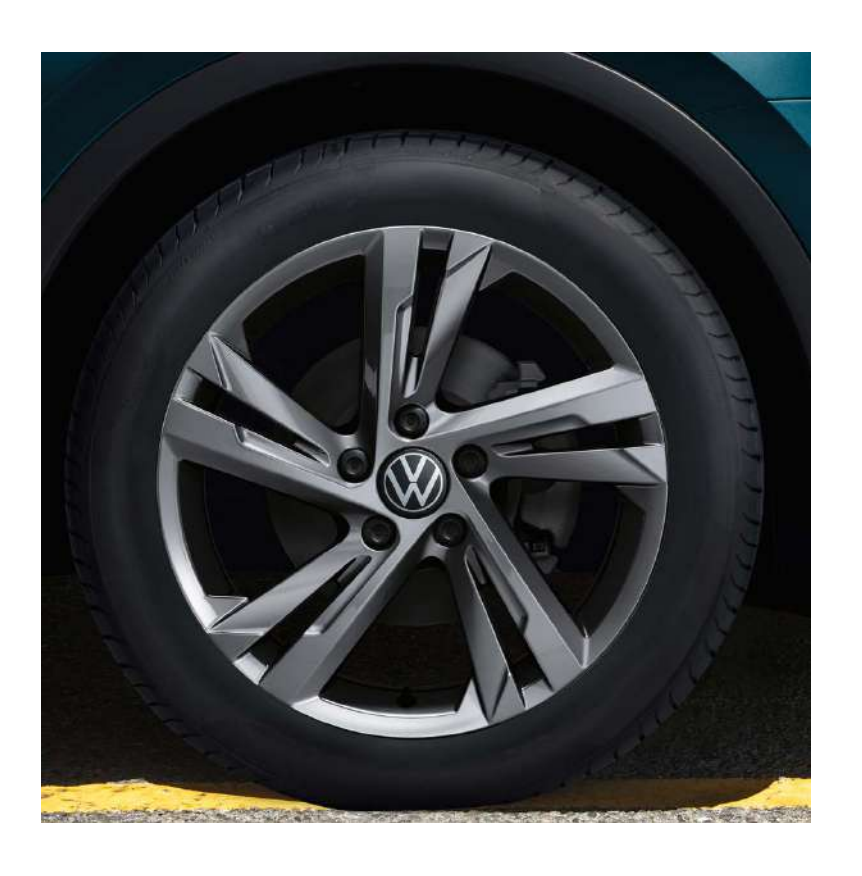
19" Valencia Alloy (Standard on R-Line)