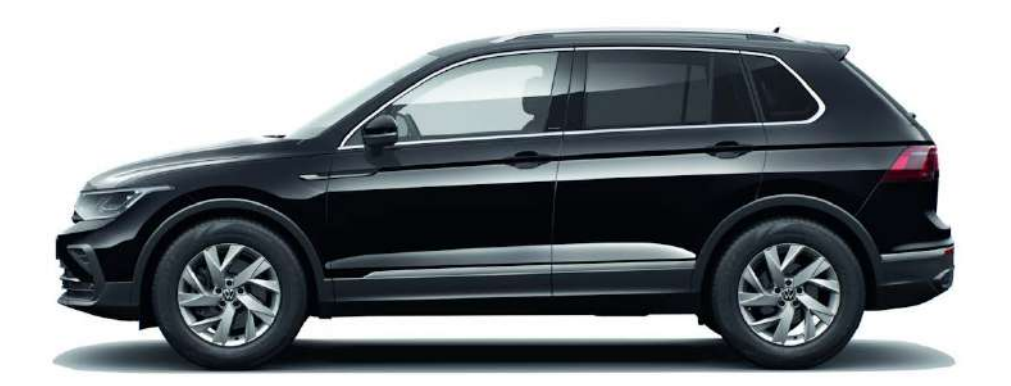
Deep Black Pearl