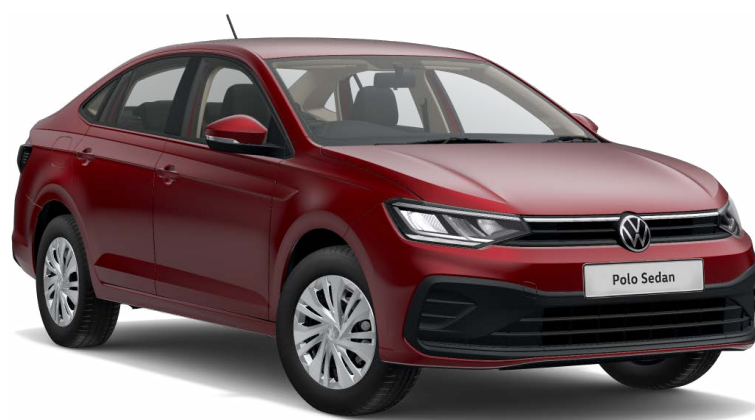
Wild Cherry Red