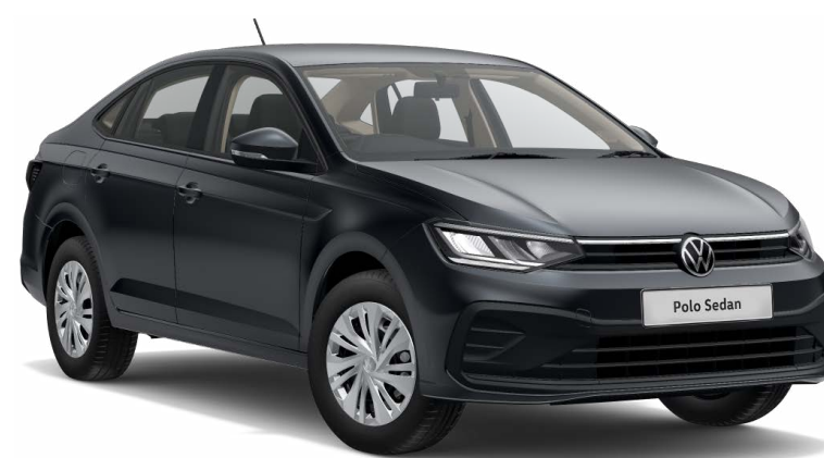
Carbon Steel Grey