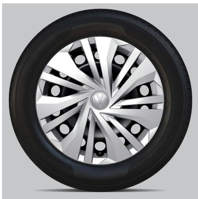
16" steel wheels (Standard on Polo Sedan)