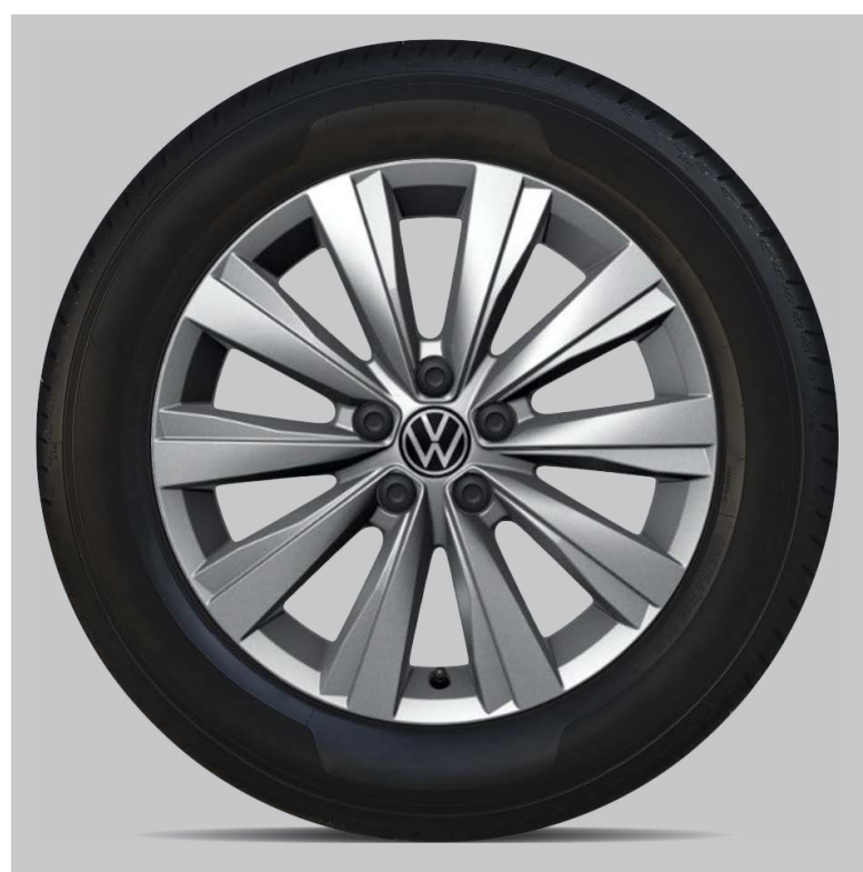
16" Scimitar Alloy (Standard on Life and Life Tiptronic)