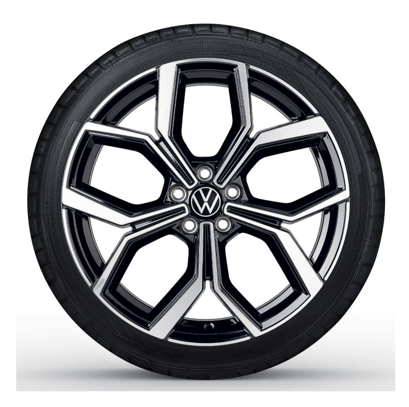
18" Faro Alloy (Optional on GTI)