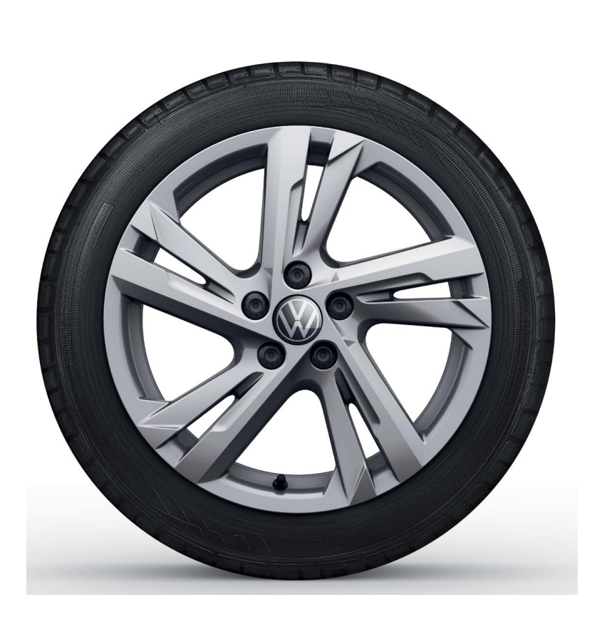
16" Valencia Alloy (Standard on R-Line)