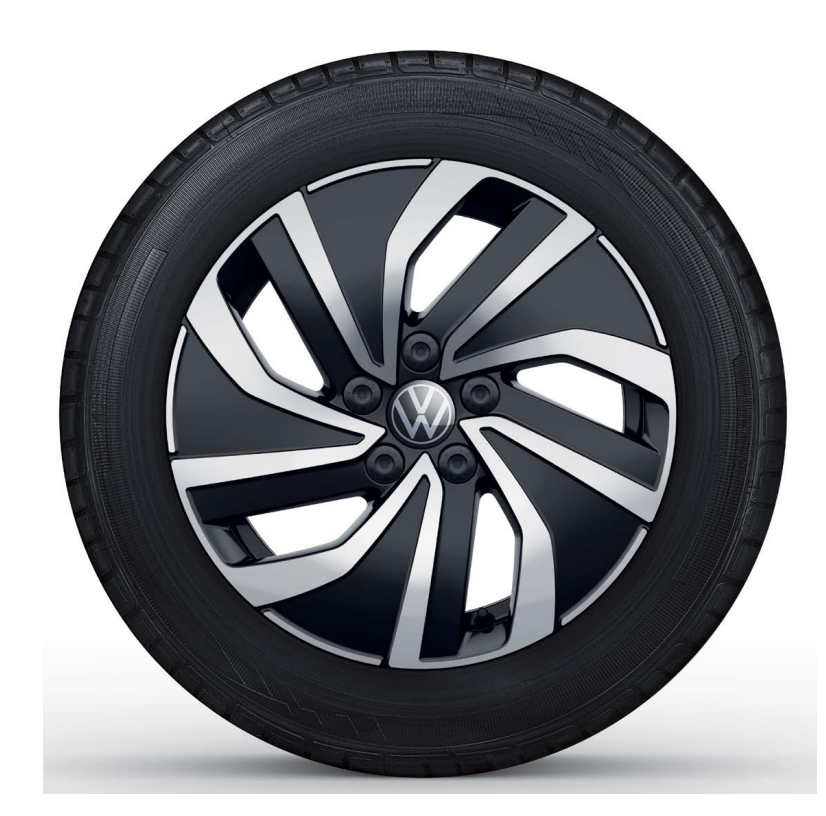
15" Essex Alloy (Optional on Polo, standard on Life)