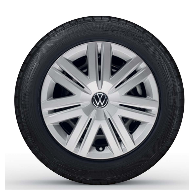
14" steel wheel cover (Standard on Polo)