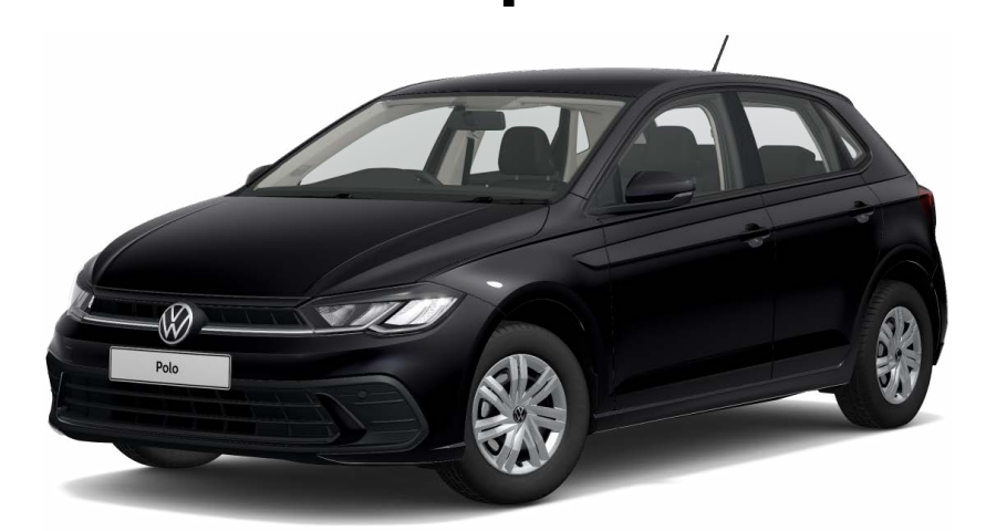
Deep Black Pearl