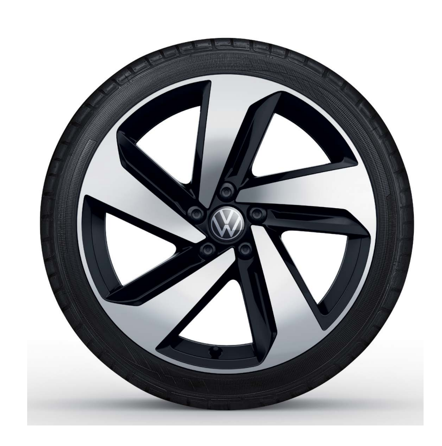
17" Milton Keynes Alloy (Standard on GTI)