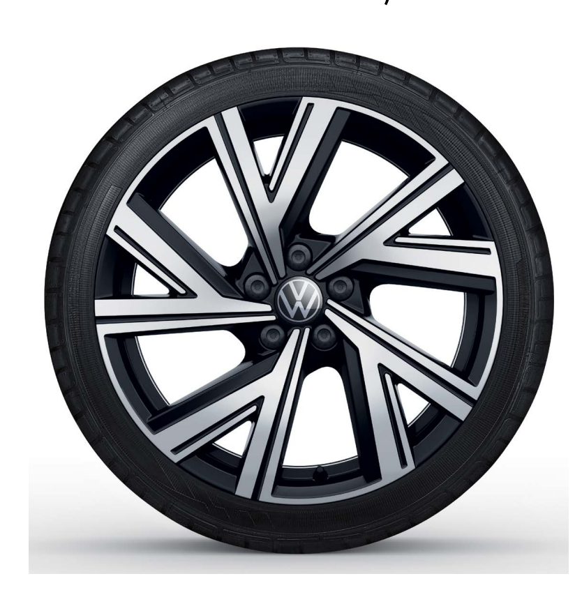
17" Bergamo Alloy(Optional on R-Line)