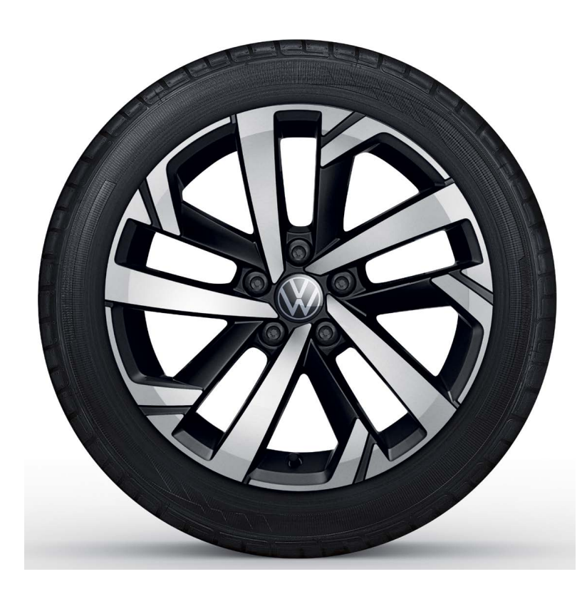
16" Torsby Alloy (Optional on Life)