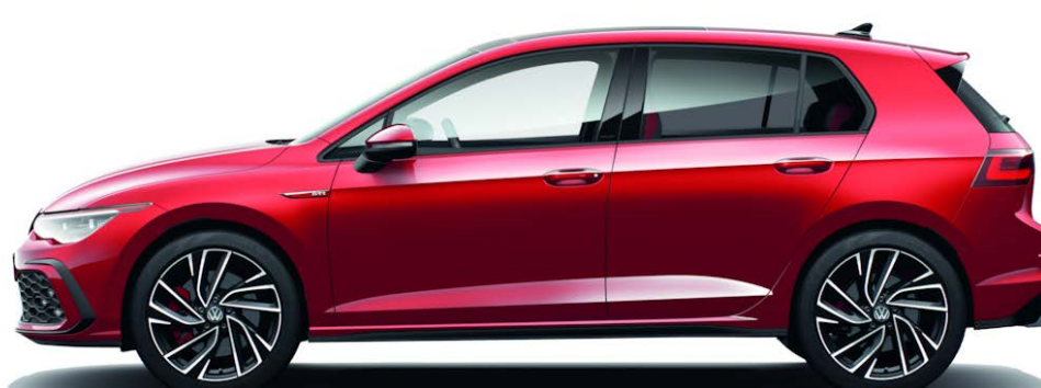
Kings Red (Available on Golf GTI)