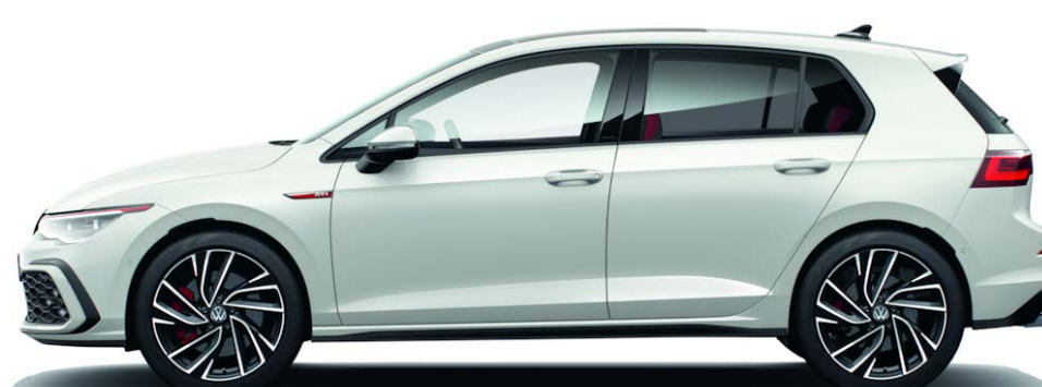
Oryx White (Available on Golf GTI)