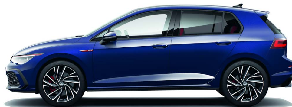
Atlantic Blue (Available on Golf GTI)