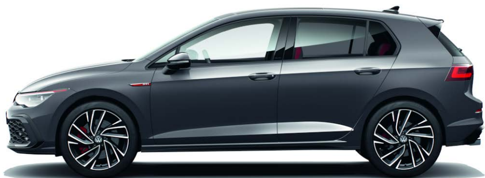
Urano Grey (Available on Golf GTI)