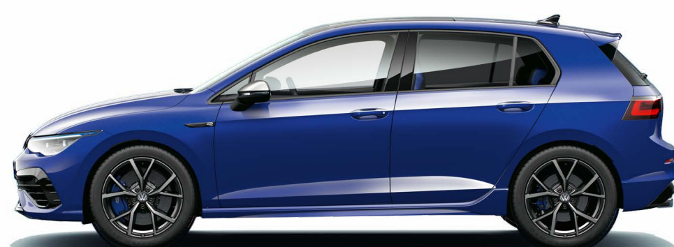
Lapiz Blue (Available on Golf R)