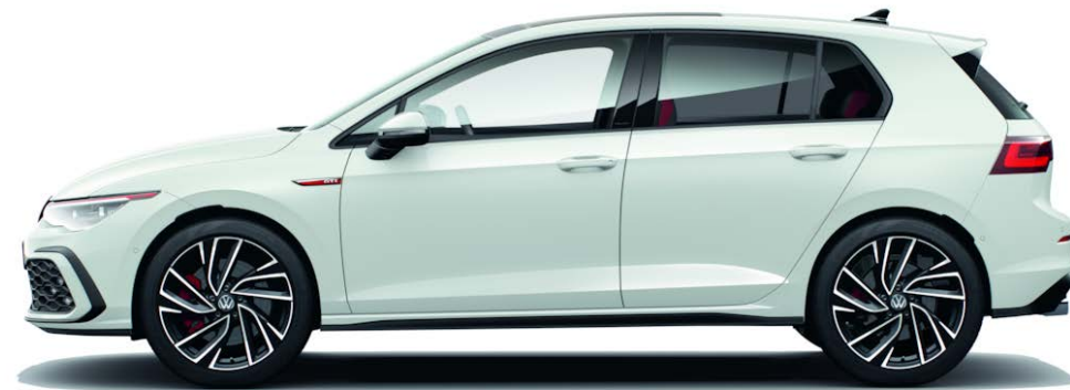
Pure White (Available on Golf GTI and R)