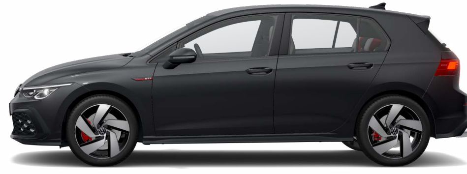
Dolphin Grey (Available on Golf GTI)