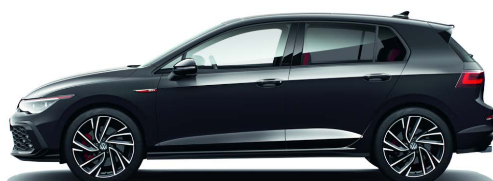
Deep Black Pearl (Available on Golf GTI and R)