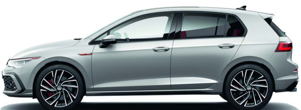
Reflex Silver (Available on Golf GTI)