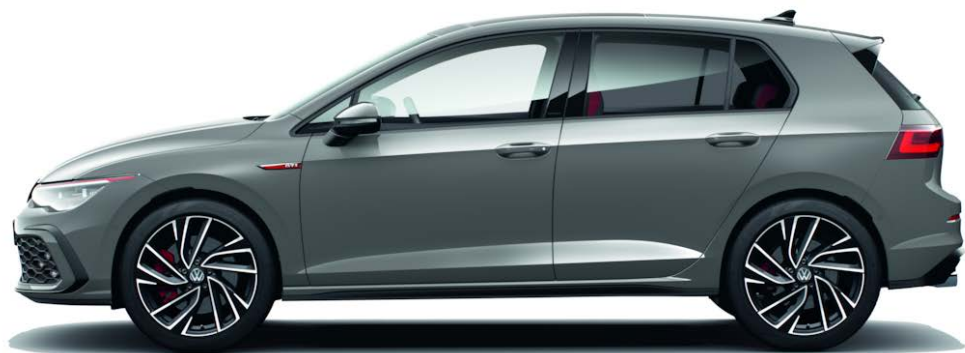
Moonstone Grey (Available on Golf GTI)