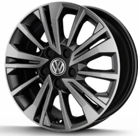
"Aracaju Black Diamond" alloy wheel 17" (Optional)