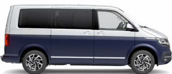
Reflex Silver/ Starlight Blue

*Availability of exterior paint finishes will vary from images shown.