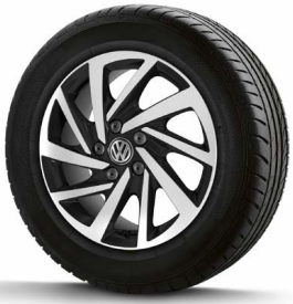
"Woodstock Black Diamond" alloy wheel 17" (Standard)