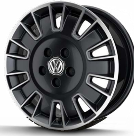
"Posada Black Diamond" alloy wheel 17" (Optional)