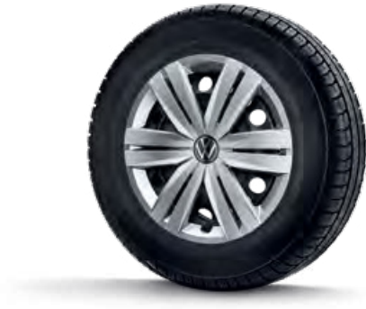
16" BLACK STEEL WHEEL 6,5 J X16