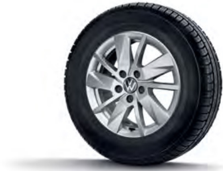
16" "WIEN" ALLOY WHEEL 6,5 J X16