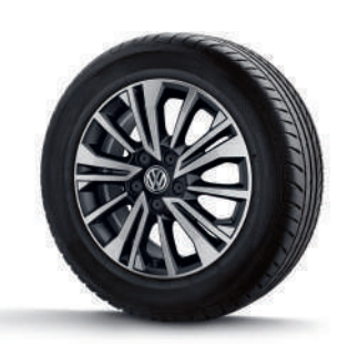
Aracaju 17 inch alloy wheel 17" (Optional)