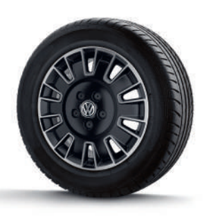
Posadas 17 inch alloy wheel 17" (Standard)

You can't embark on an adventure without the right set of wheels. Choose from our range of alloy wheels and hit the road with confidence.