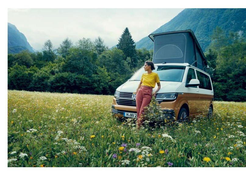
Availability of exterior paint finishes will vary from images shown.

The California 6.1 has a strong and sophisticated design so you can experience the outdoors in style. From sleek body-coloured bumpers, a power sliding door in the passenger compartment, LED headlamps with separate LED daytime running lights, exterior mirror housings and door handles, to a manually operated pop-up roof with two side windows, canvas in Basalt Grey and mounting rails on the roof – this robust and hard-wearing camper van was designed for making memories.