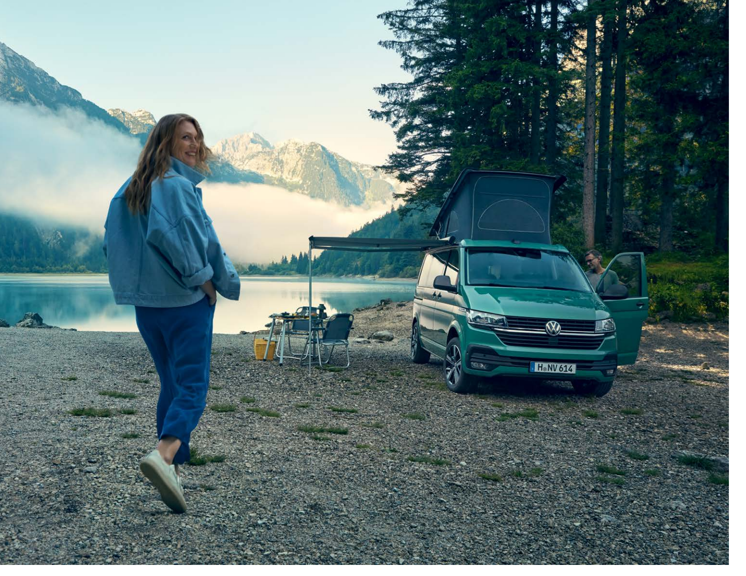
Availability of exterior paint finishes will vary from images shown.