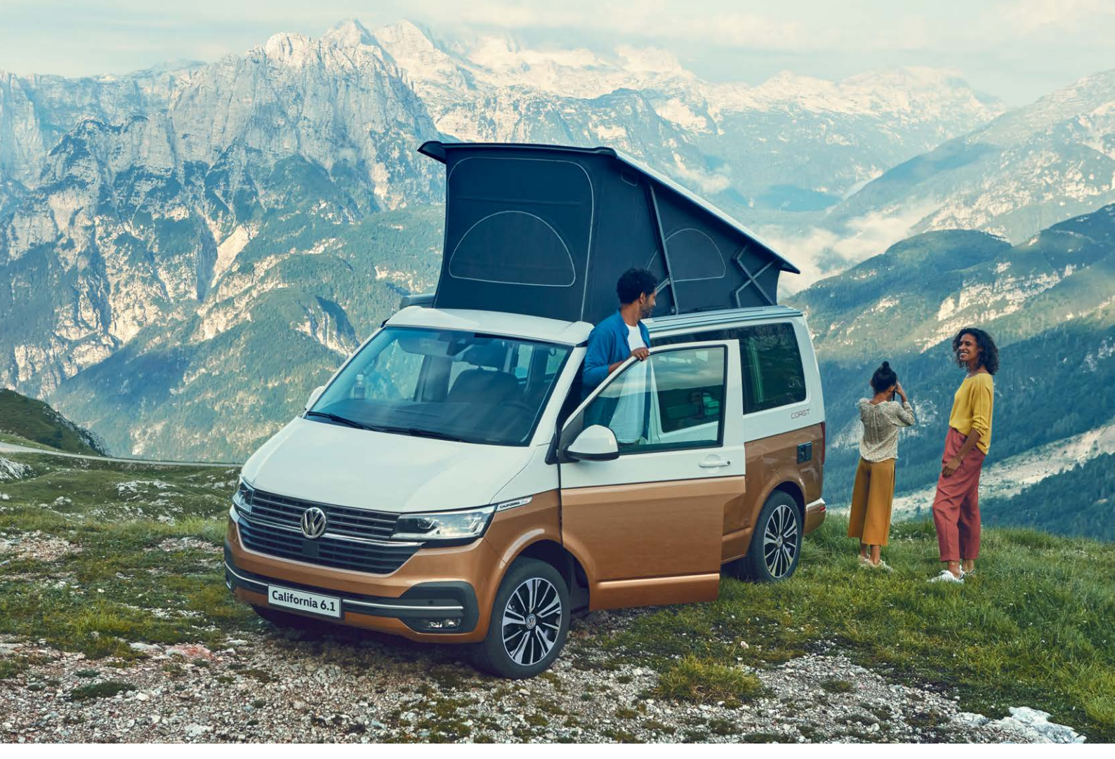
Availability of exterior paint finishes will vary from images shown.